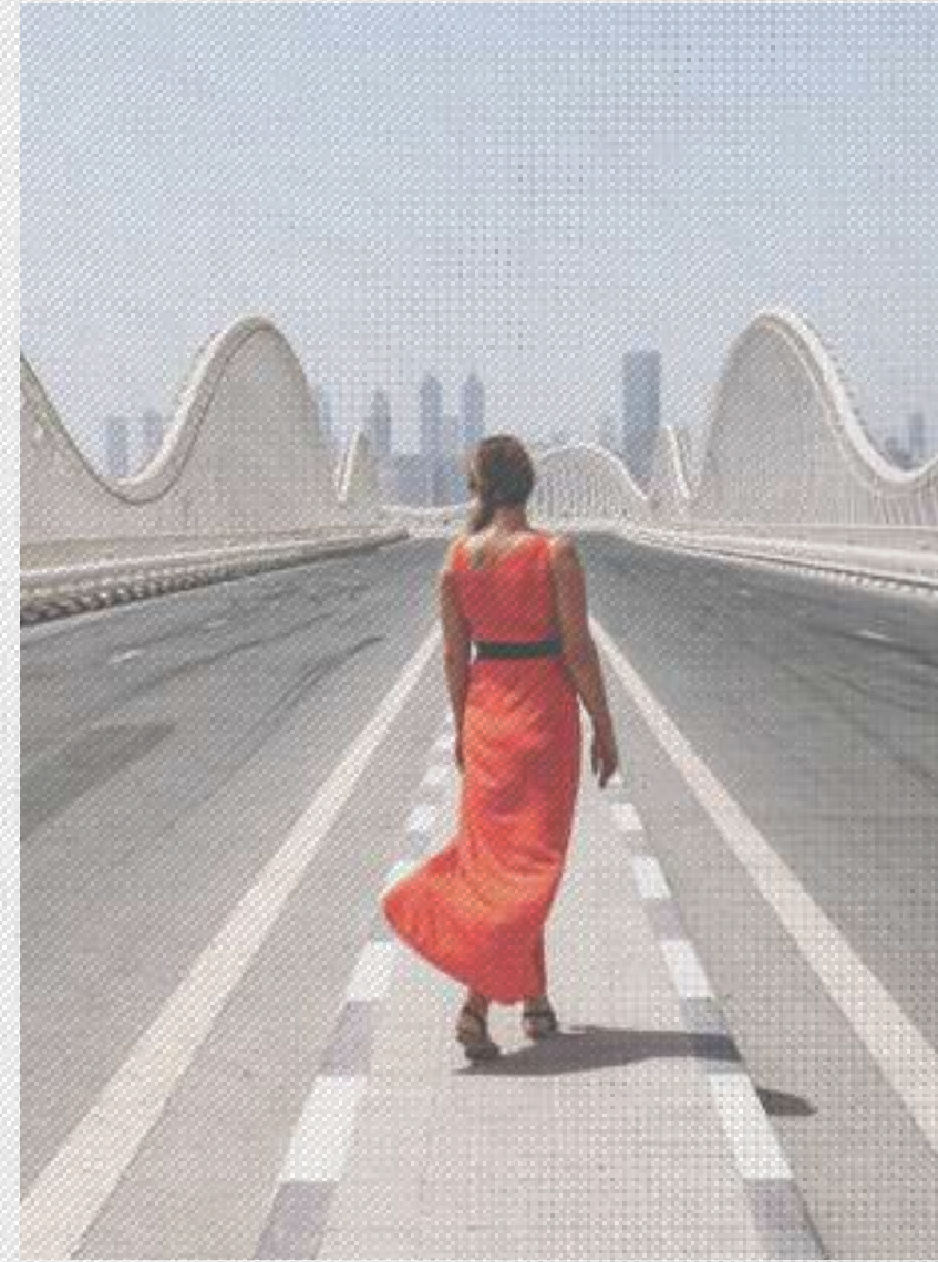
Exterior Community View

Together, the glass facade and layered terraces give the building a unique identity, setting a new standard for architecture in this exclusive area.