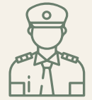
24 Hour Security