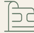
3 Dubai Metro Stations Nearby