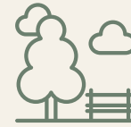
Lush Greenery and Landscaping