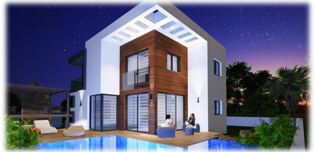
Zodiac City - Aries Villas