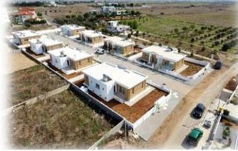
Stilos Villas 1