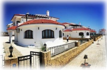
Zodiac City - Virgo Villa