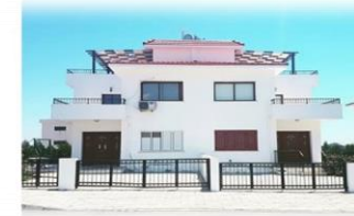
Zodiac City - Gemini Villa