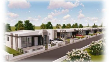
Stilos Villas 2