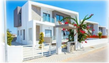
Ikon Premium Villas