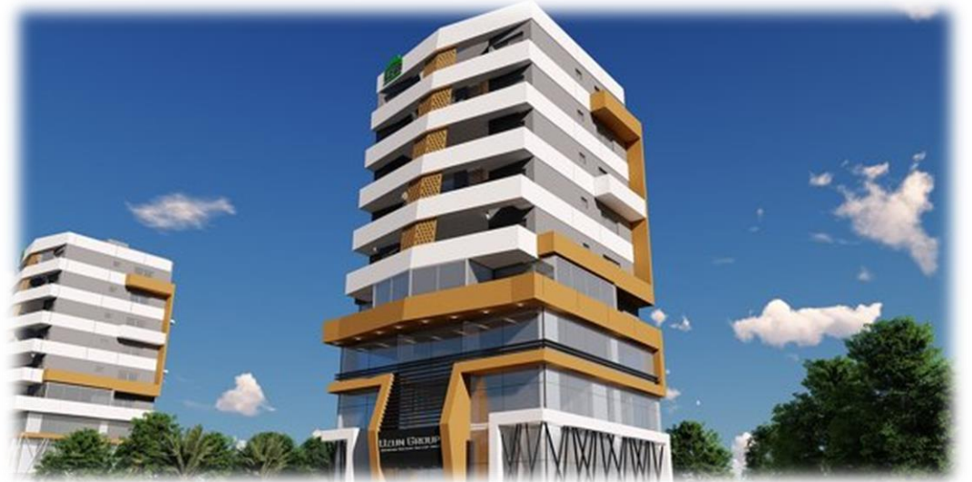
Uzun Group Fam agusta Office