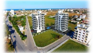
Vanora Park Salmis