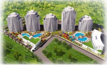
Sky Deluxia Life