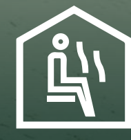
Sauna & Steam Room