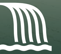
Water Fall Feature