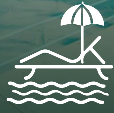
A Luxurious & Large Leisure Pool Deck