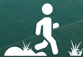
Rooftop Jogging Track