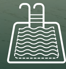
Private Pools Inside Apartments