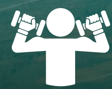
Full Health Club Indoor & Outdoor Gym