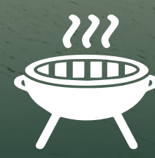
Rooftop Barbeque Area