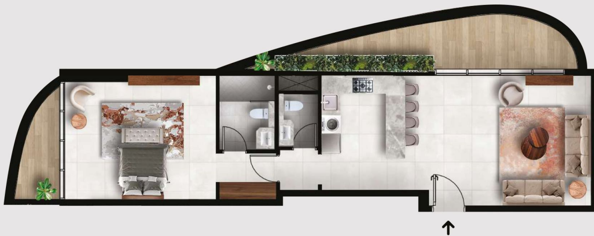
FLOOR PLAN TYPE B