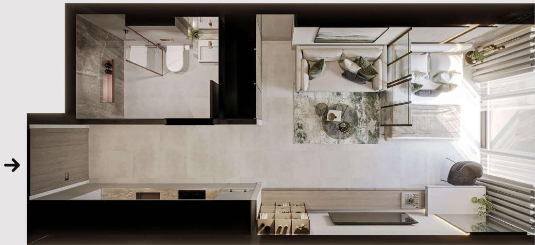
FLOOR PLAN TYPE A