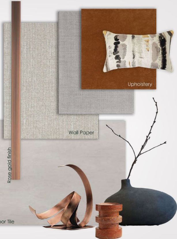
Rose gold finish