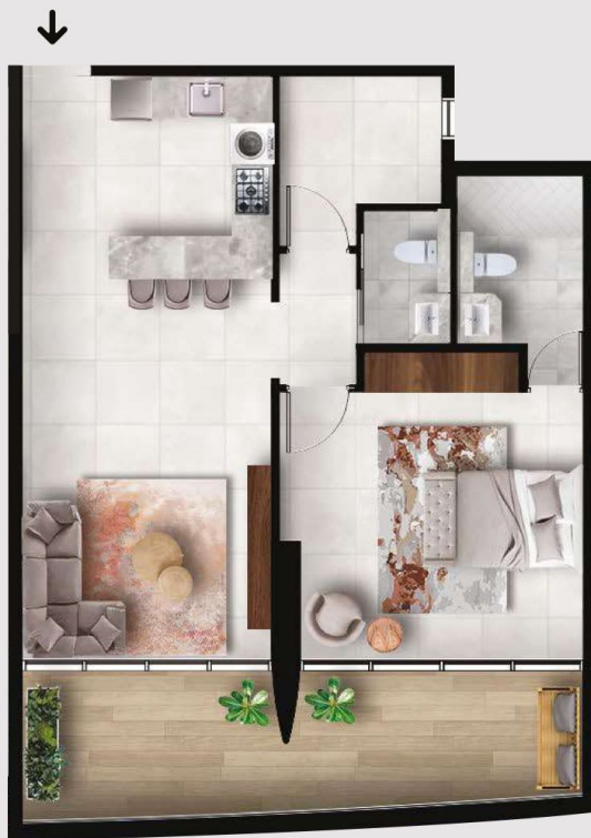
FLOOR PLAN TYPE D