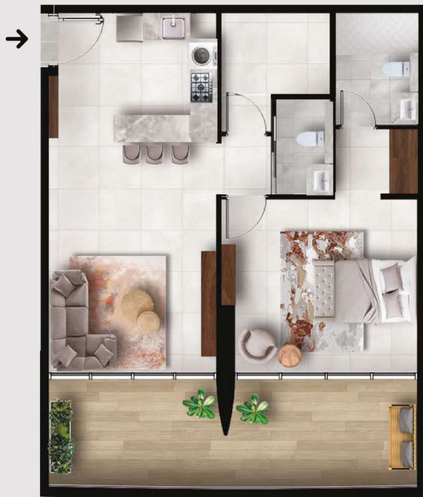
FLOOR PLAN TYPE C