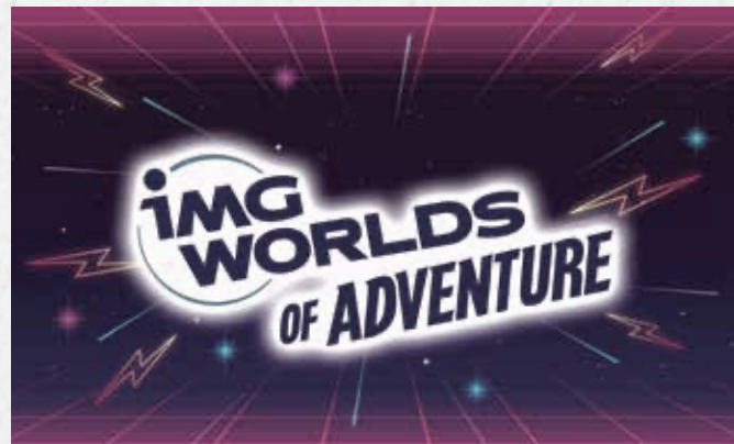
▲ IMG WORLD OF ADVENTURE 10-15 MINUTES AWAY