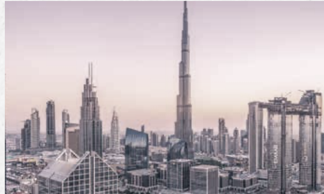
▲ BURJ KHALIFA AND DUBAI MALL 20-25 MINUTES AWAY