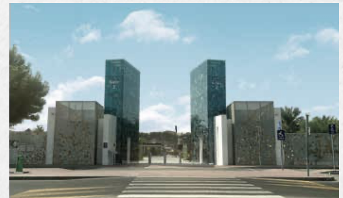
▲ QURANIC PARK 20-25 MINUTES AWAY