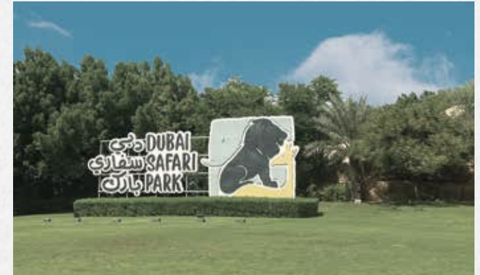
▲ DUBAI SAFARI PARK 10-15 MINUTES AWAY