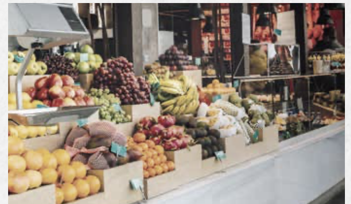
▲ DUBAI CENTRAL FRUIT AND VEGETABLE MARKET 5-10 MINUTES AWAY