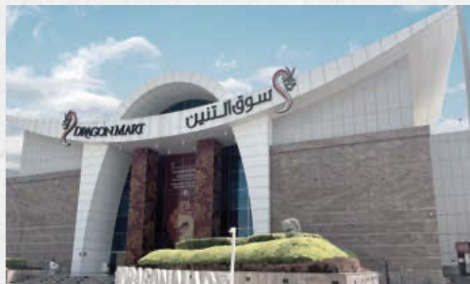
▲ DRAGON MART 10-15 MINUTES AWAY