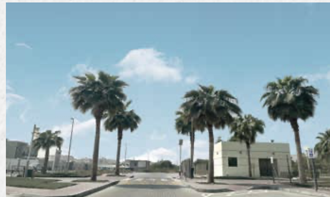
▲ AL WARQA COMMUNITY 15-20 MINUTES AWAY