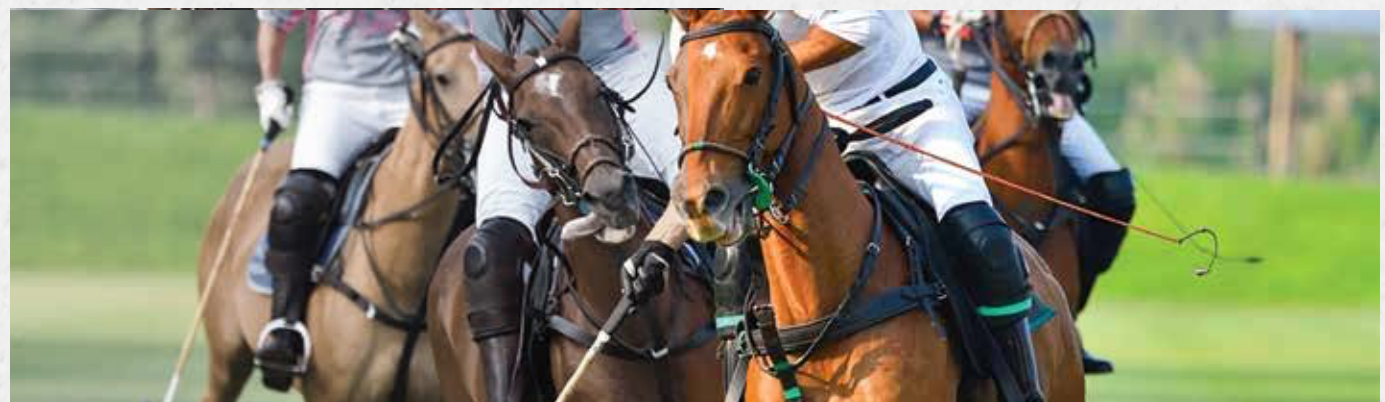
▲ DESERT PALM POLO CLUB 10-15 MINUTES AWAY