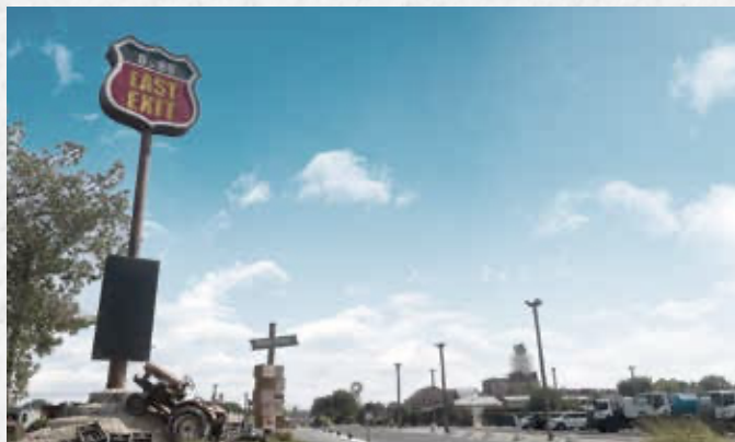
▲ THE LAST EXIT AL KHAWANEJ 20-25 MINUTES AWAY