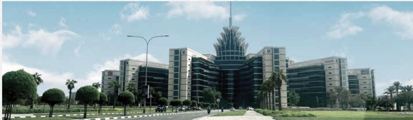
▲ DUBAI SILICON OASIS 5-10 MINUTES AWAY