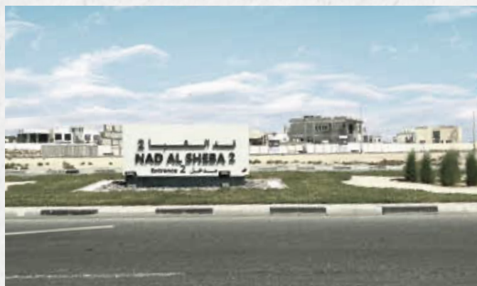
▲ NAD AL SHIBA 10-15 MINUTES AWAY