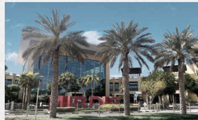
▲ CITY CENTRE MIRDIF 15-20 MINUTES AWAY