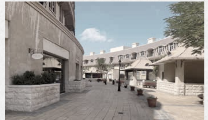
▲ UPTOWN MIRDIF 15-20 MINUTES AWAY