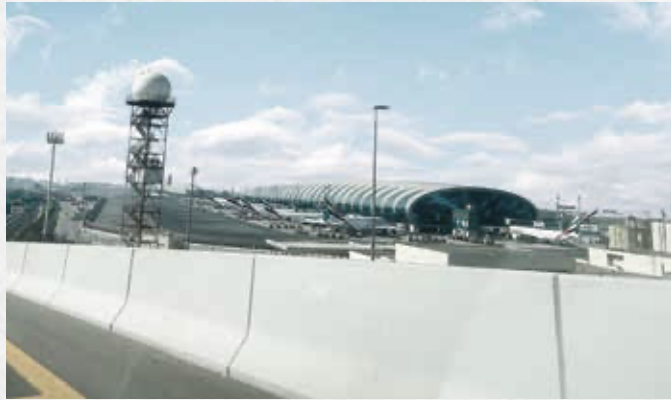
▲ DUBAI INTL AIRPORT 15-20 MINUTES AWAY