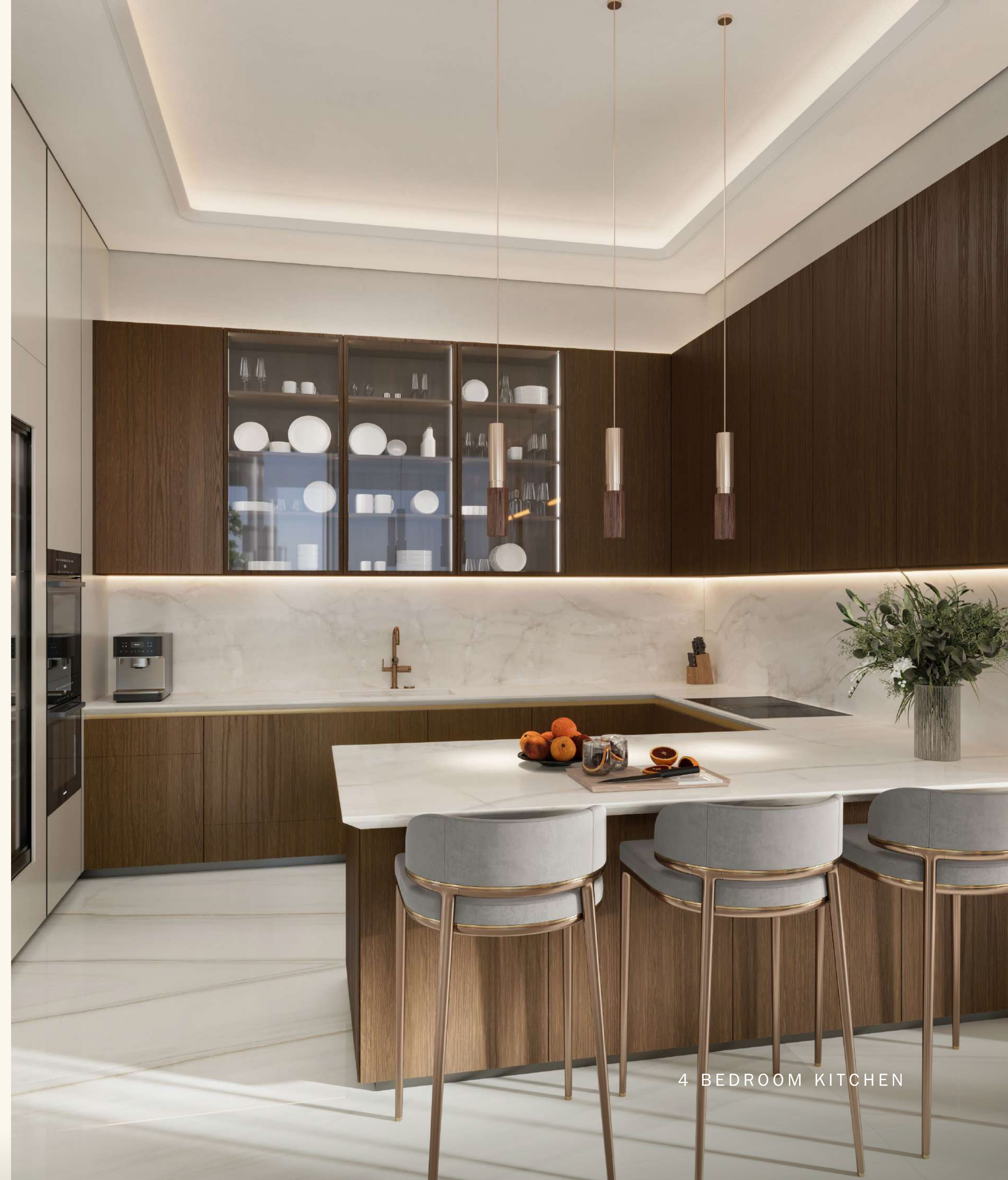
4 BEDROOM KITCHEN