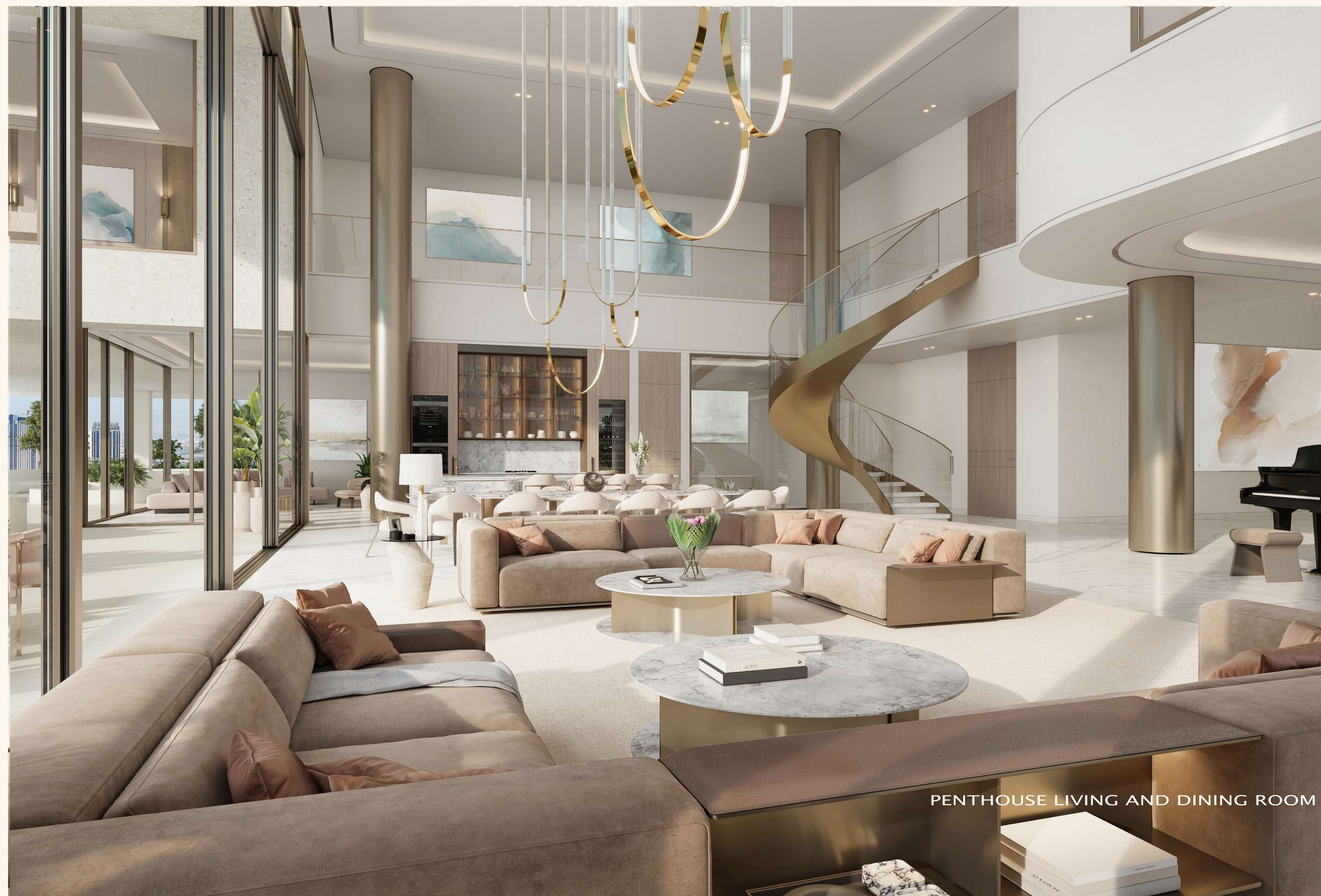
PENTHOUSE LIVING AND DINING ROOM