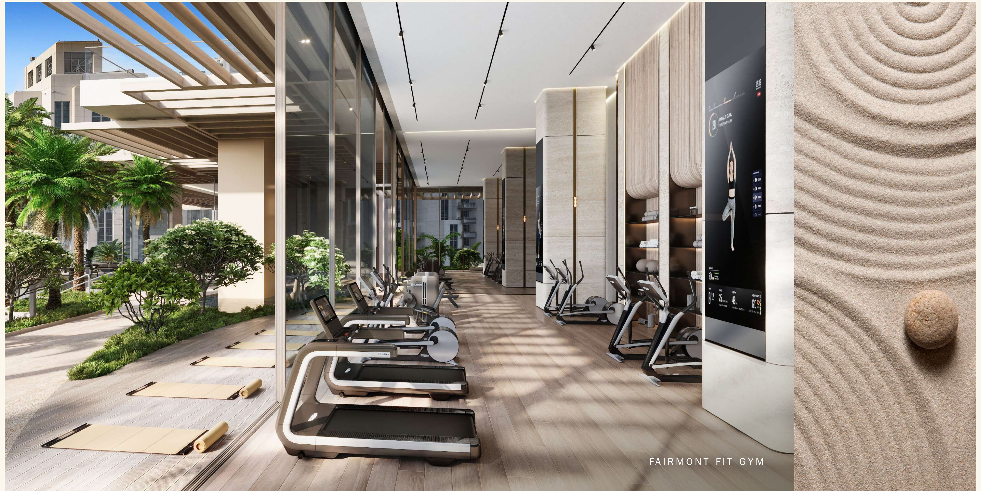
FAIRMONT FIT GYM