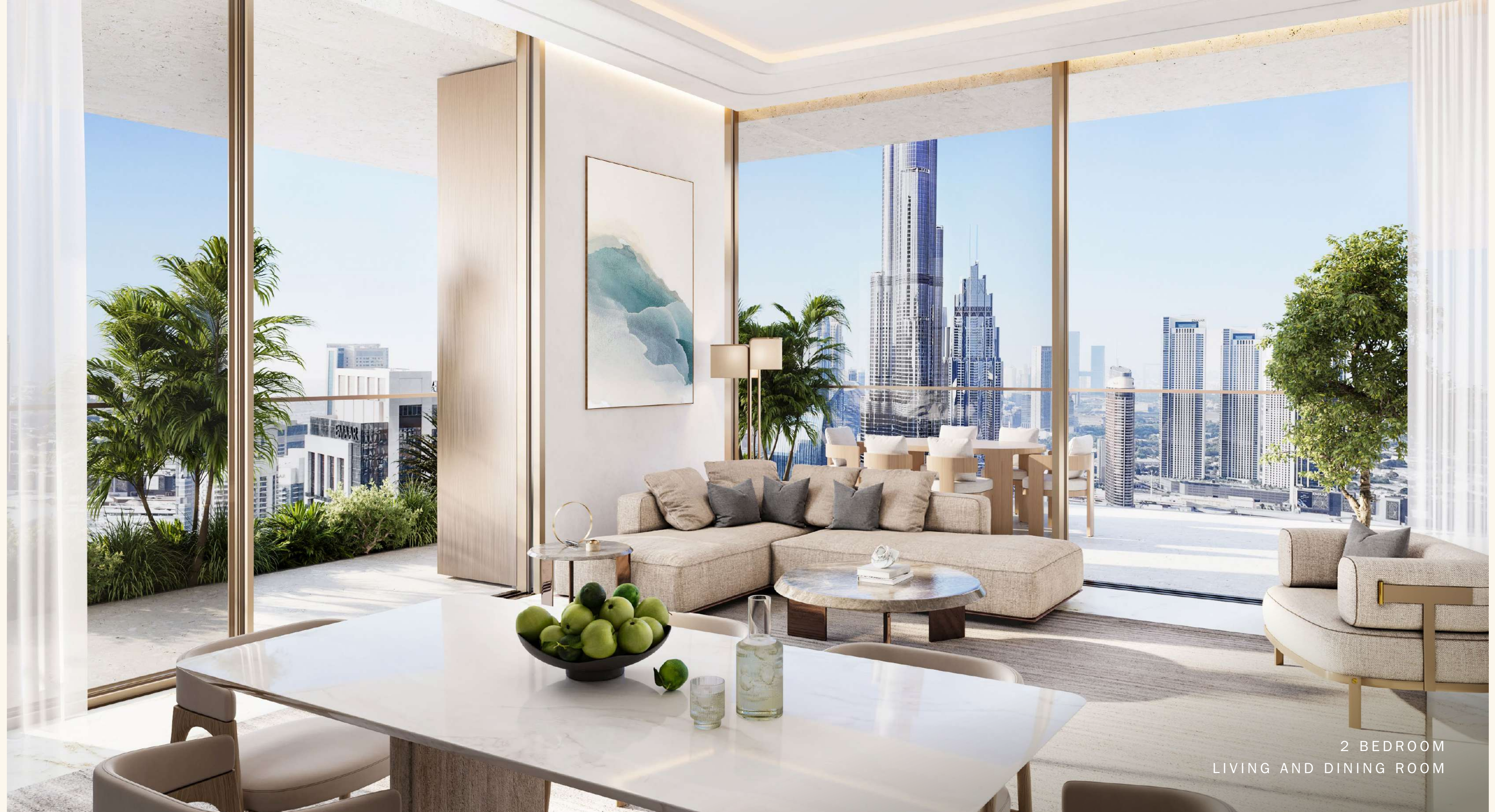
2 BEDROOM LIVING AND DINING ROOM

EXQUISITE SPACES FOR ENTERTAINING GUESTS, CONNECTING WITH LOVED ONES, OR SIMPLY DELIGHTING THE SENSES.