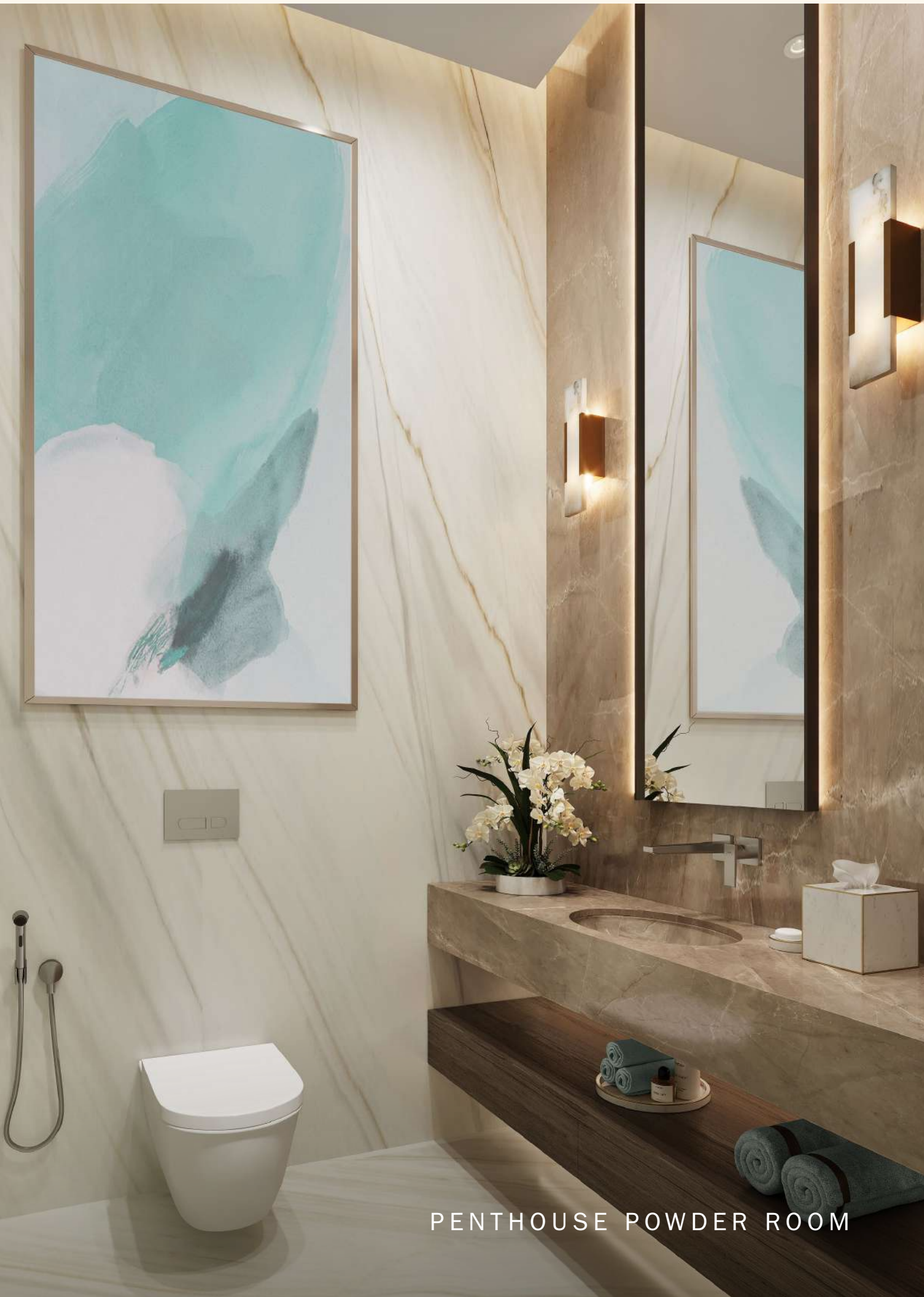
PENTHOUSE POWDER ROOM