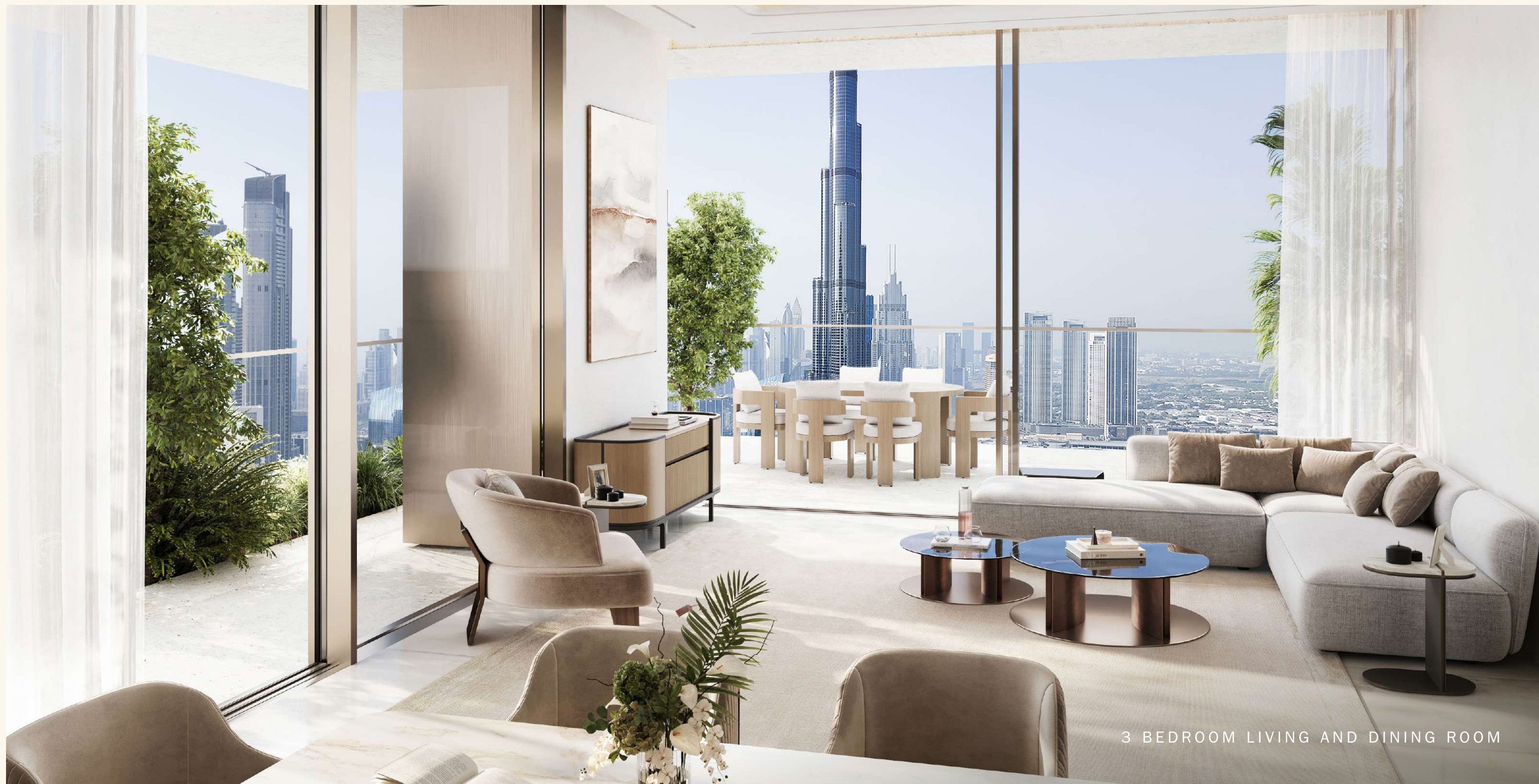
3 BEDROOM LIVING AND DINING ROOM