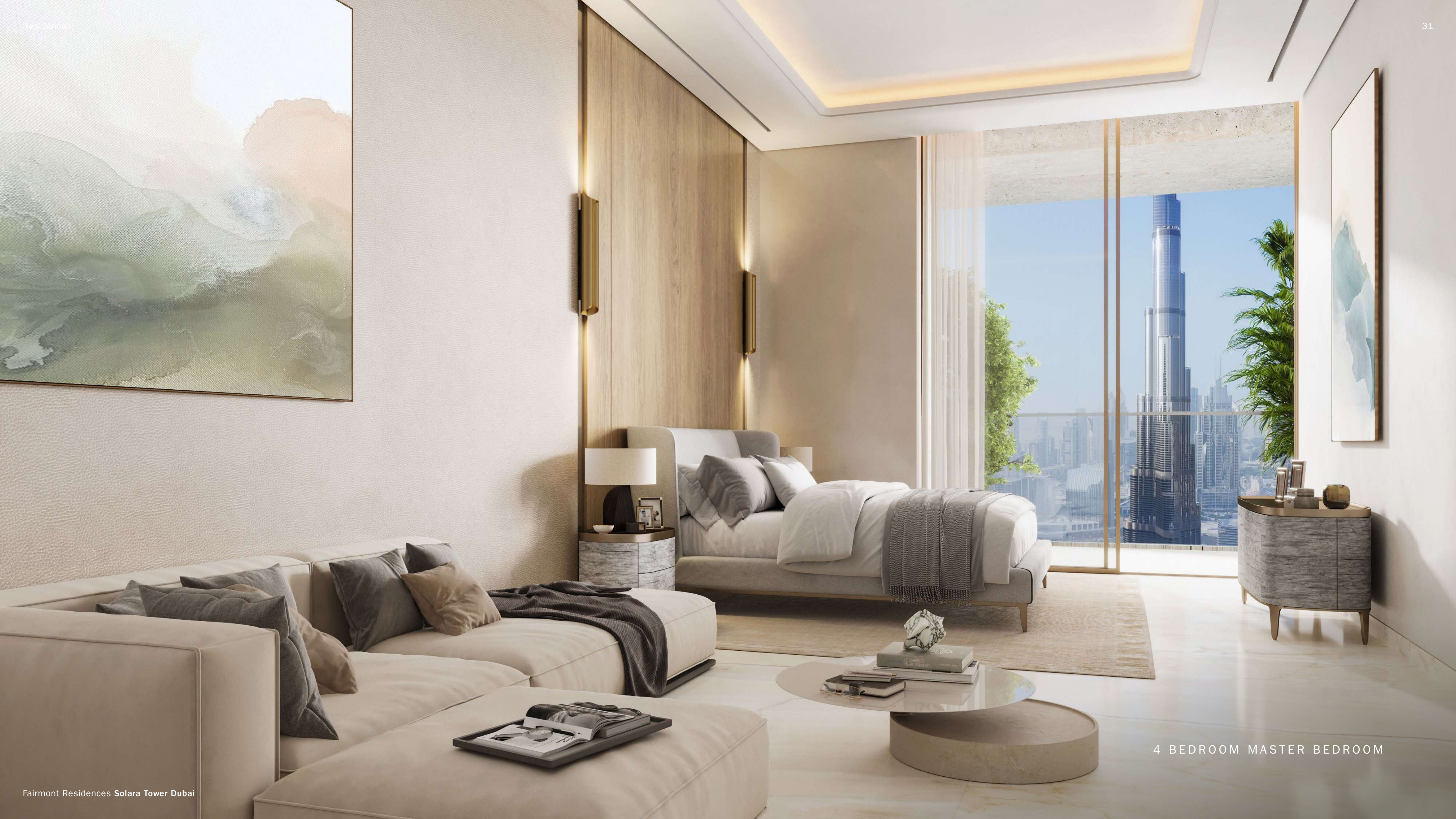
4 BEDROOM MASTER BEDROOM