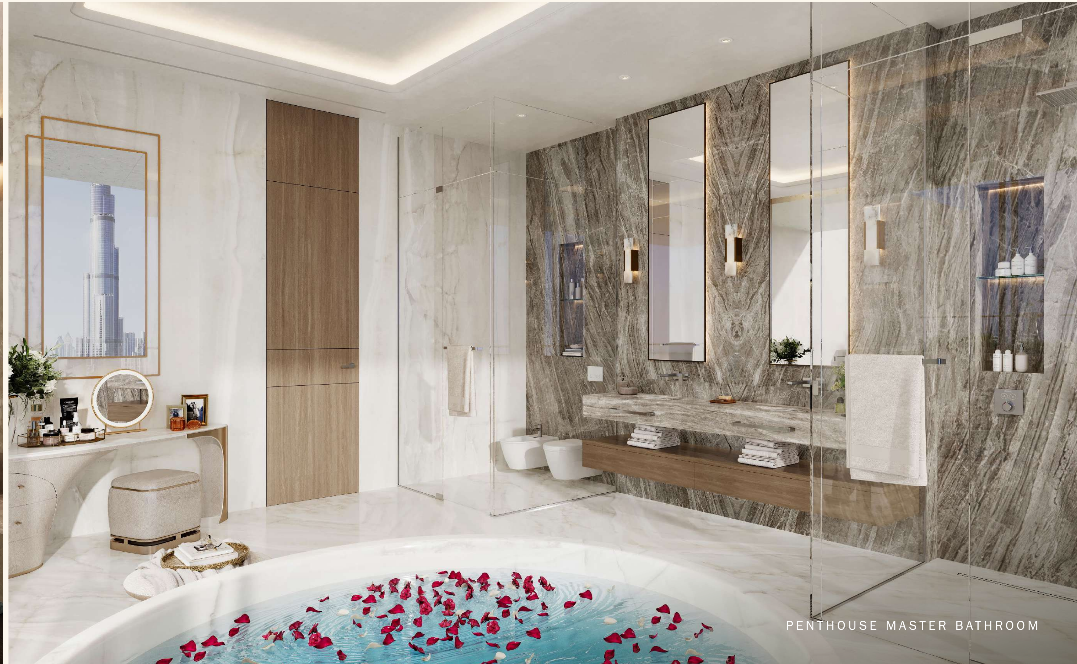
PENTHOUSE MASTER BATHROOM