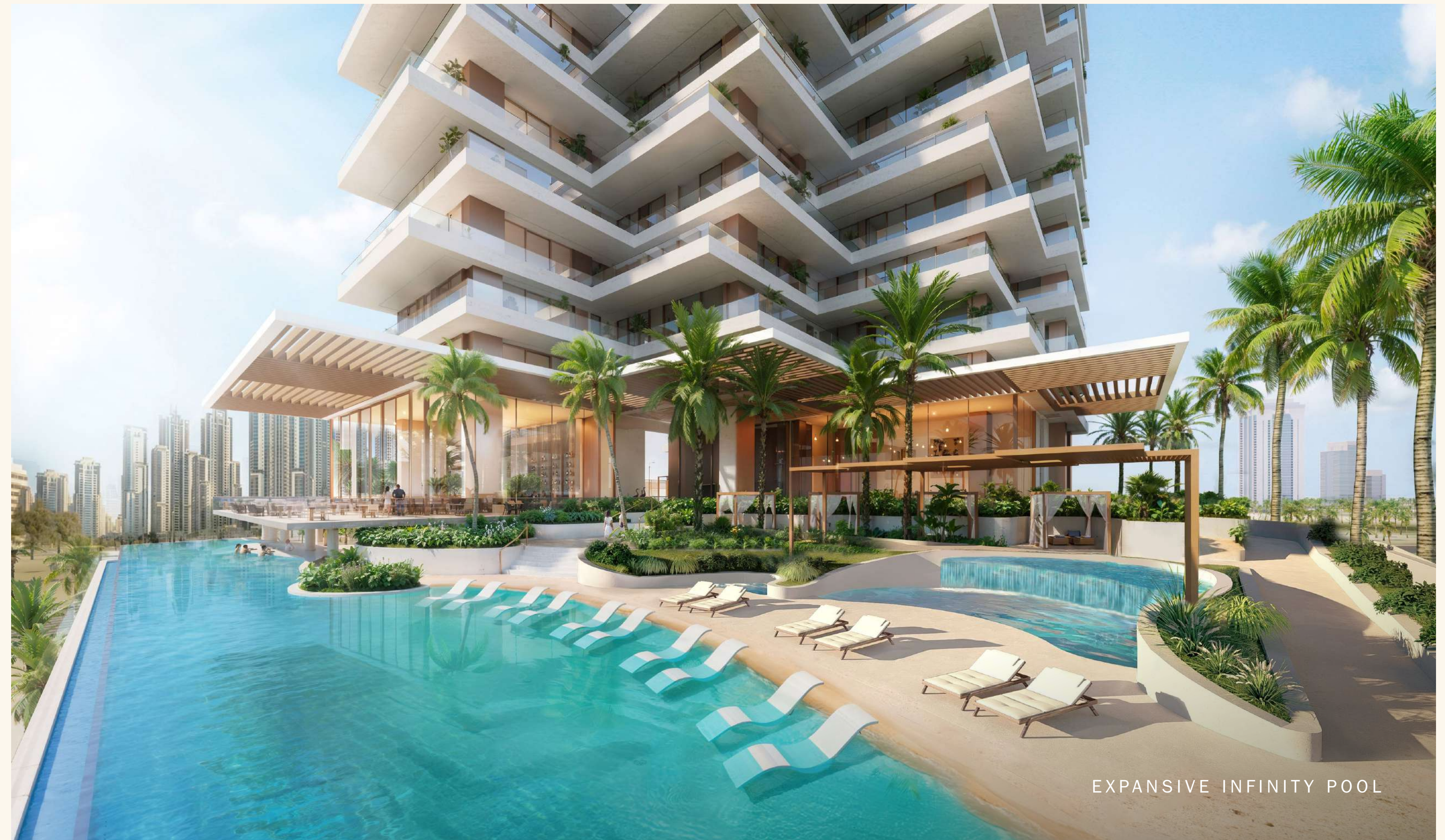
EXPANSIVE INFINITY POOL

Spanning the entire width of the building, this 60-meter podium-level infinity pool provides a perfect setting for families and friends to rejuvenate and enjoy.