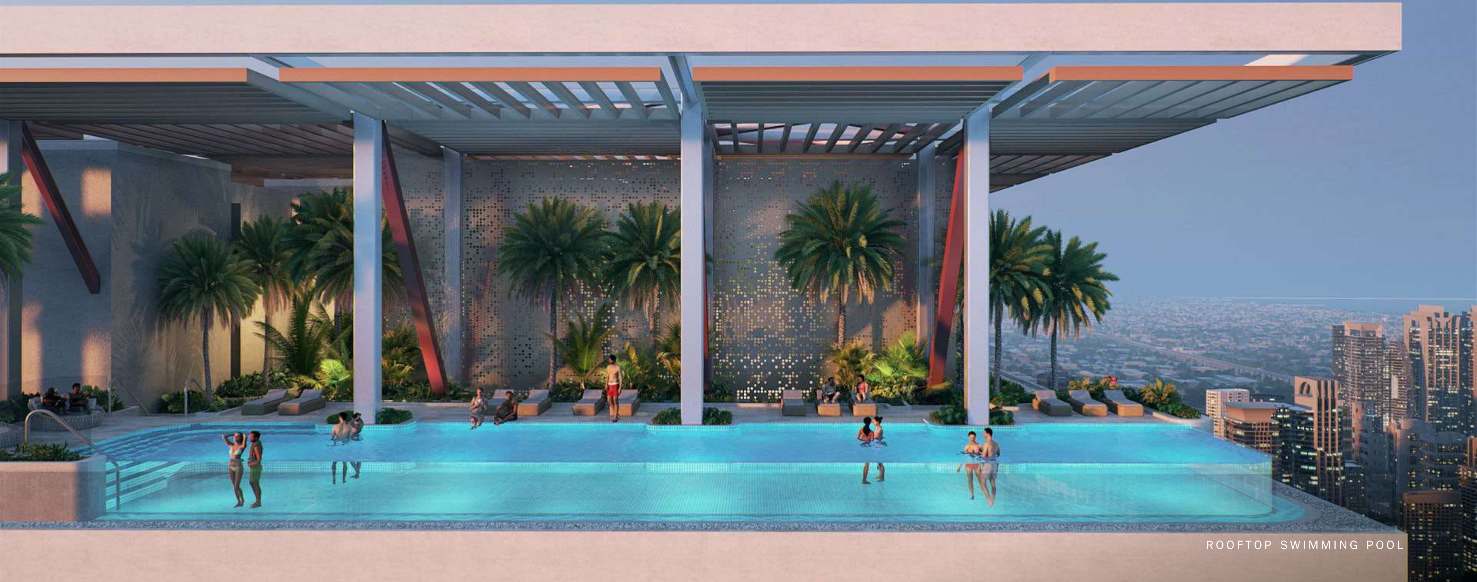
ROOFTOP SWIMMING POOL

WHETHER YOU'RE TOASTING WITH FRIENDS OR ENJOYING A QUIET EVENING UNDER THE STARS, THE ROOFTOP AMENITIES OFFER UNRIVALLED INDULGENCE AND A CELEBRATION OF LIFE AT ITS FULLEST.