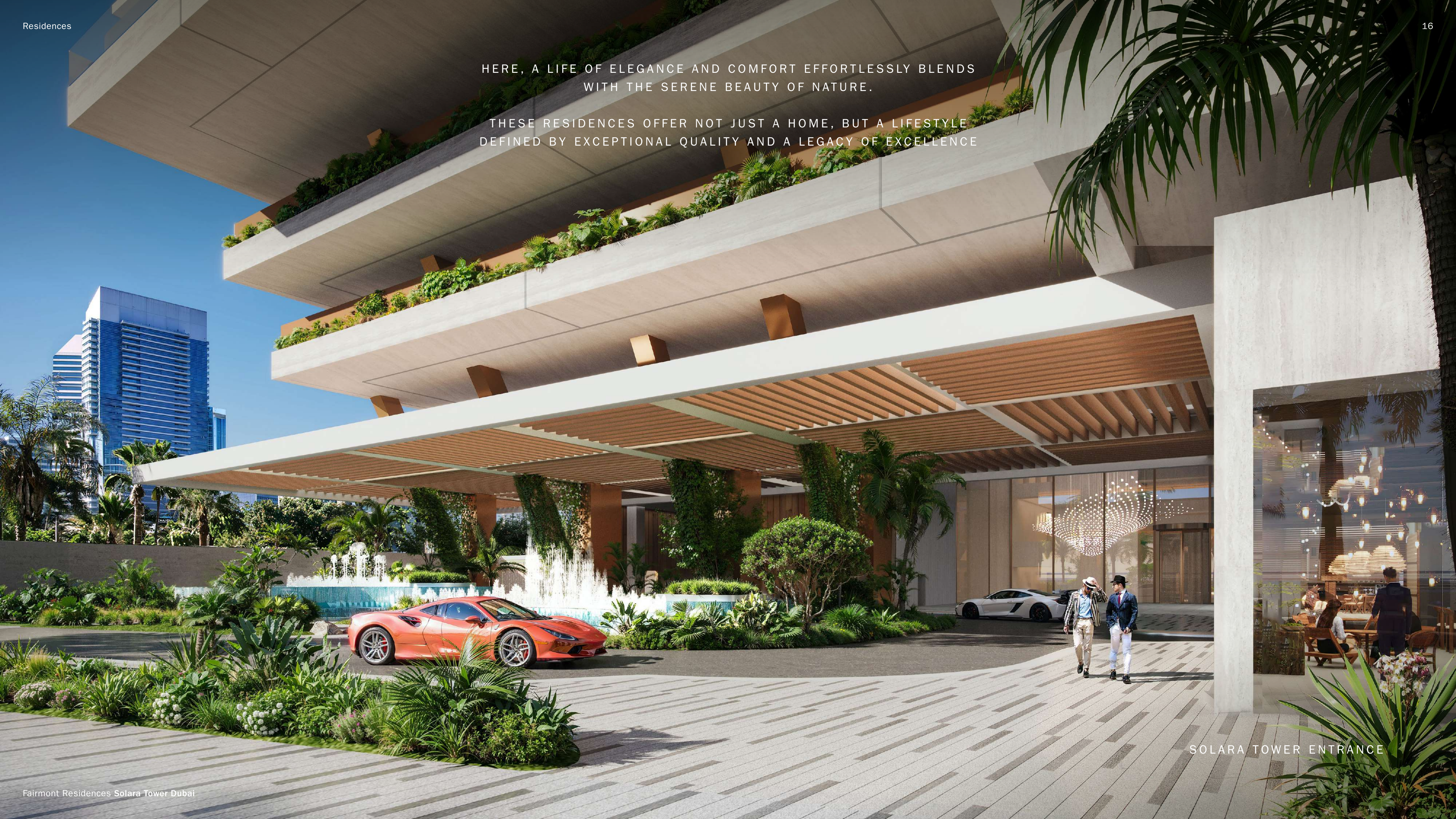
SOLARA TOWER ENTRANCE

THESE RESIDENCES OFFER NOT JUST A HOME, BUT A LIFESTYLE DEFINED BY EXCEPTIONAL QUALITY AND A LEGACY OF EXCELLENCE