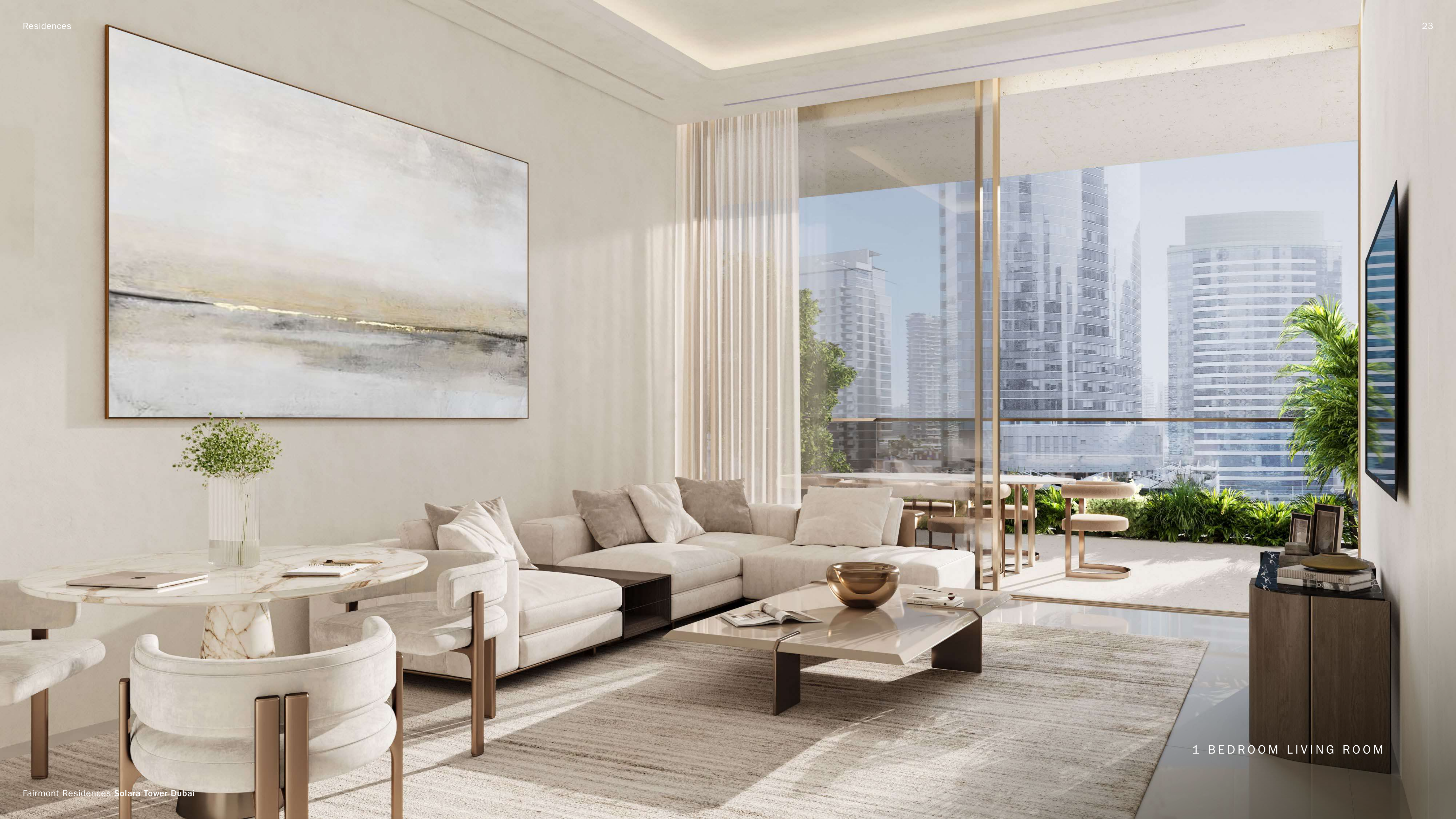
1 BEDROOM LIVING ROOM