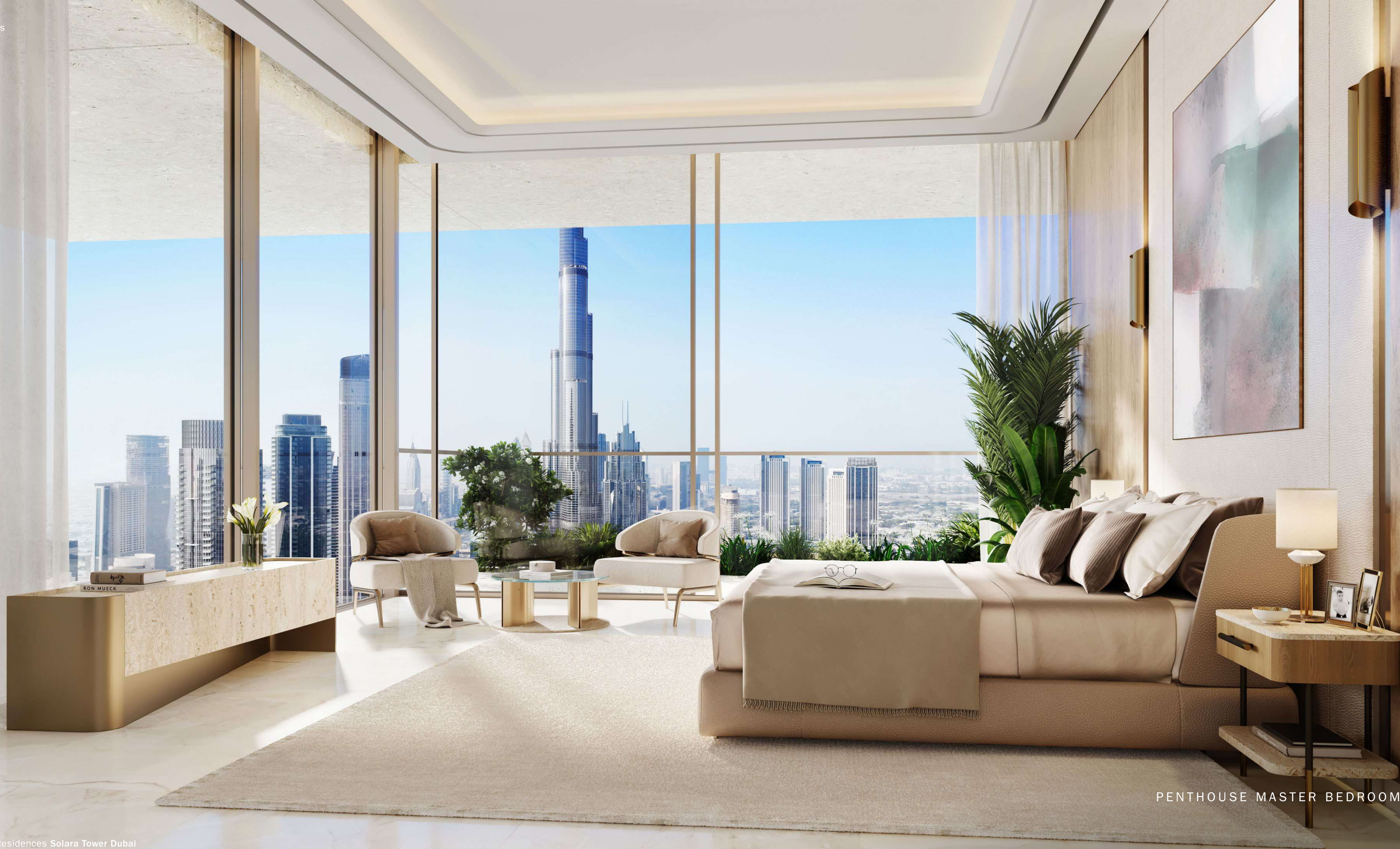
PENTHOUSE MASTER BEDROOM