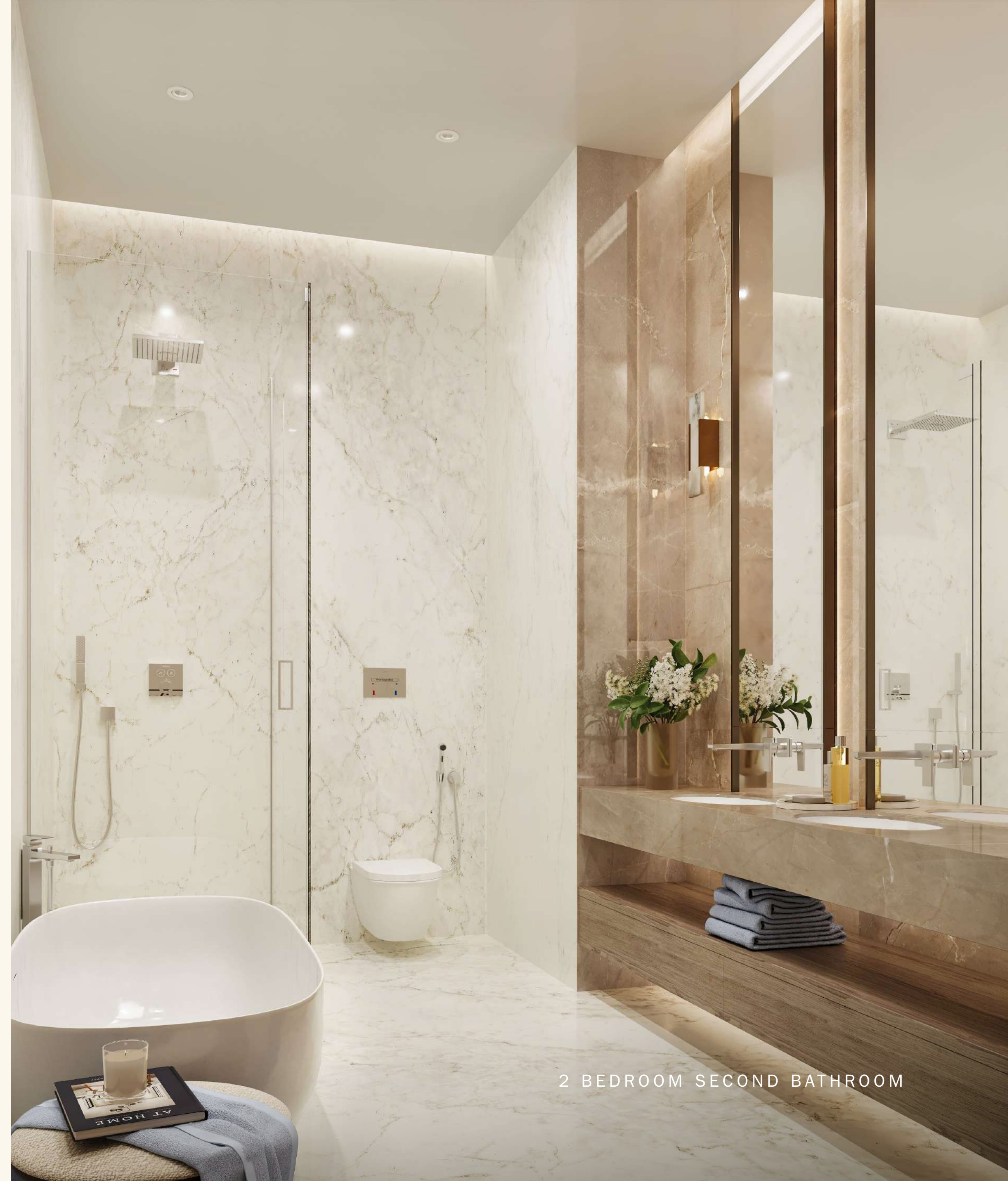
2 BEDROOM SECOND BATHROOM