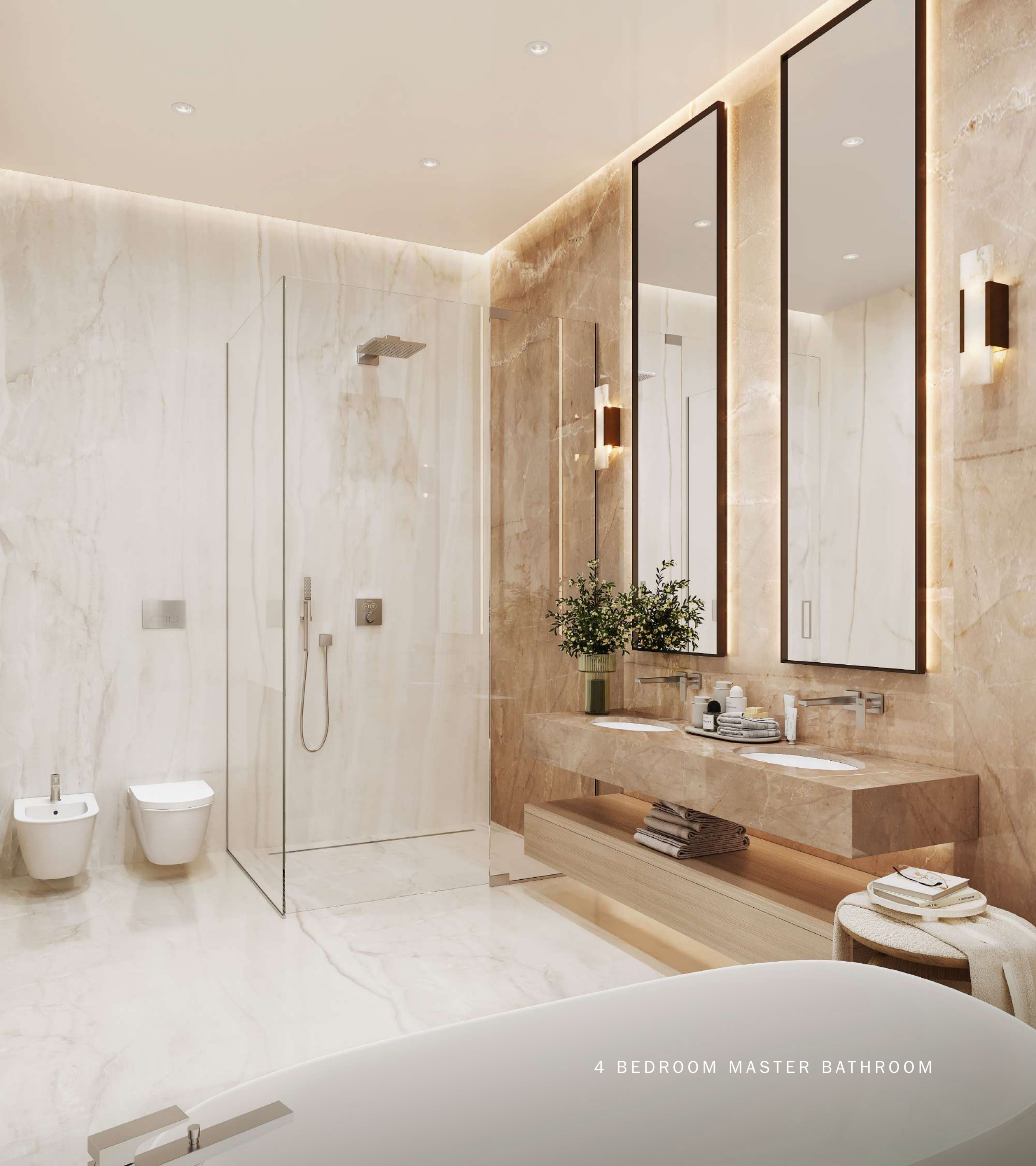
4 BEDROOM MASTER BATHROOM