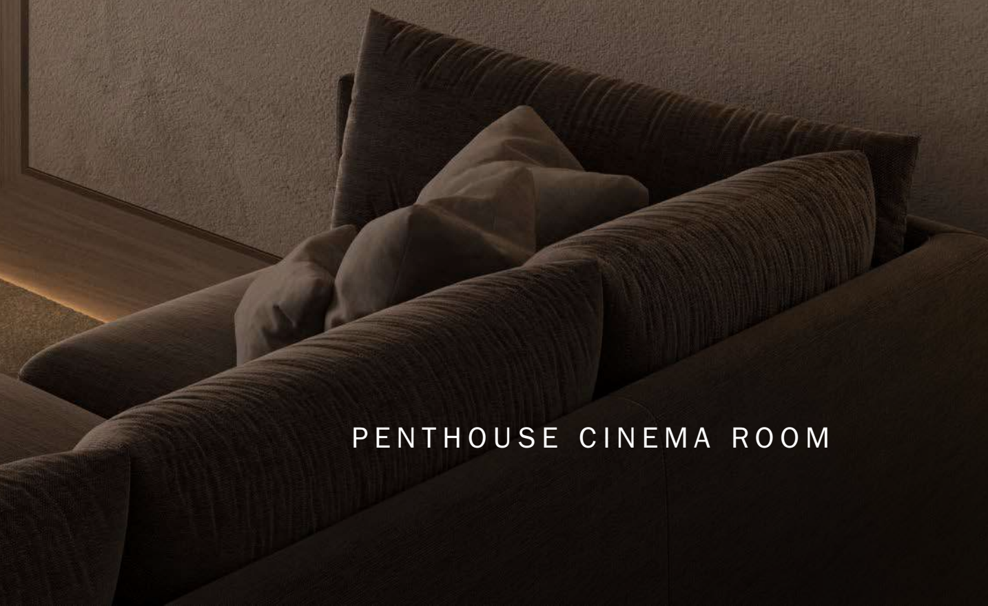
PENTHOUSE CINEMA ROOM