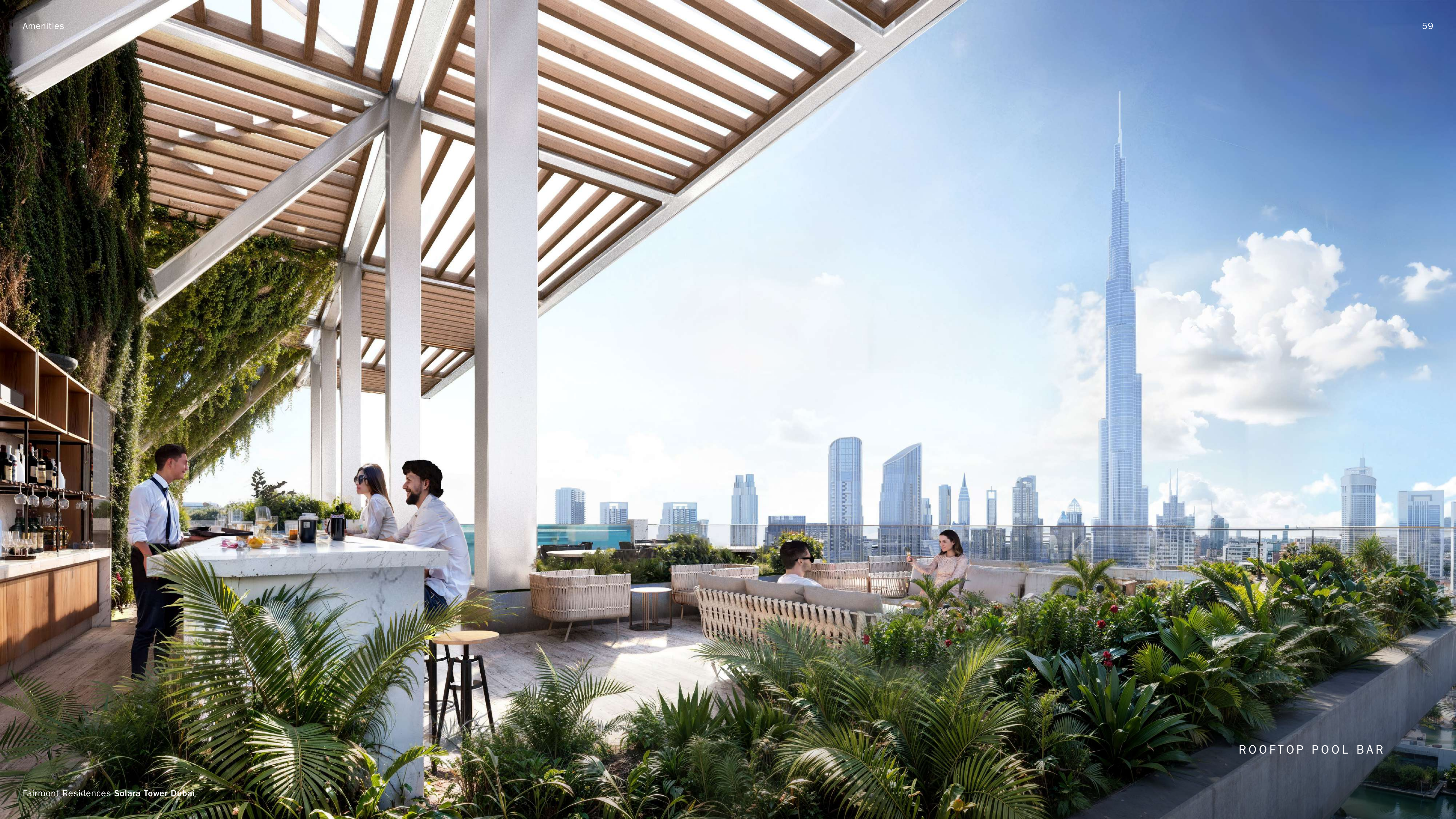
ROOFTOP POOL BAR