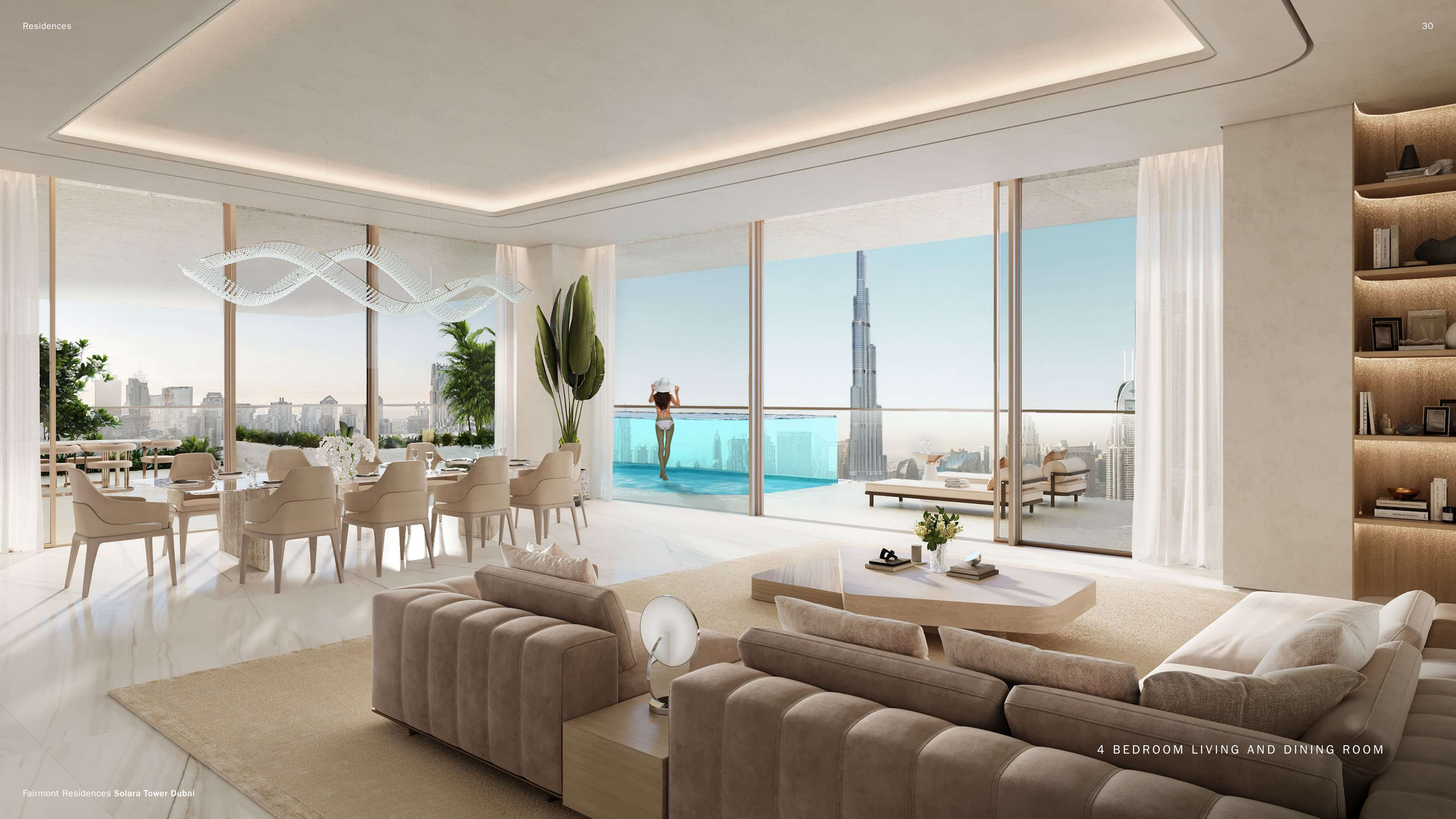
4 BEDROOM LIVING AND DINING ROOM