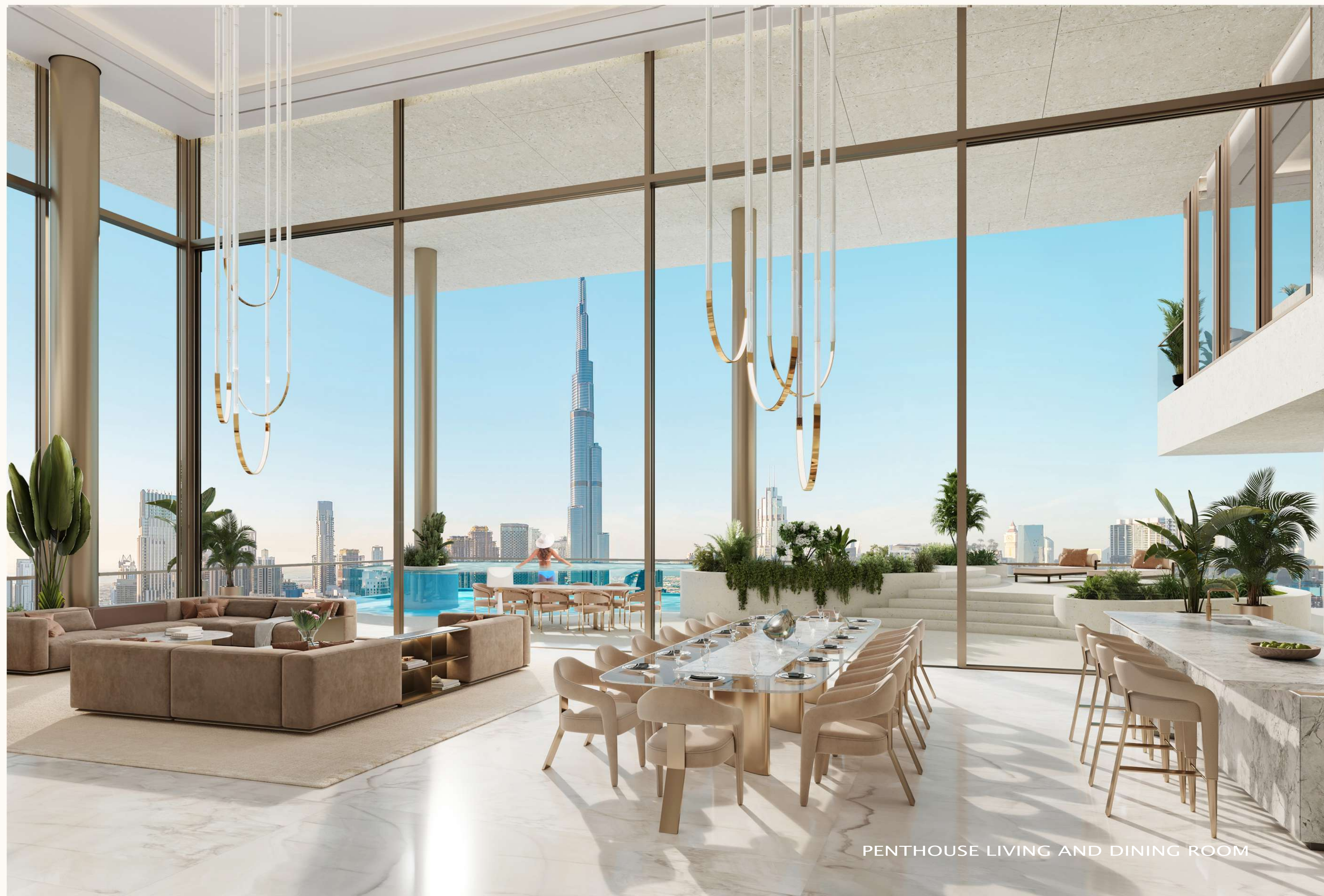
PENTHOUSE LIVING AND DINING ROOM