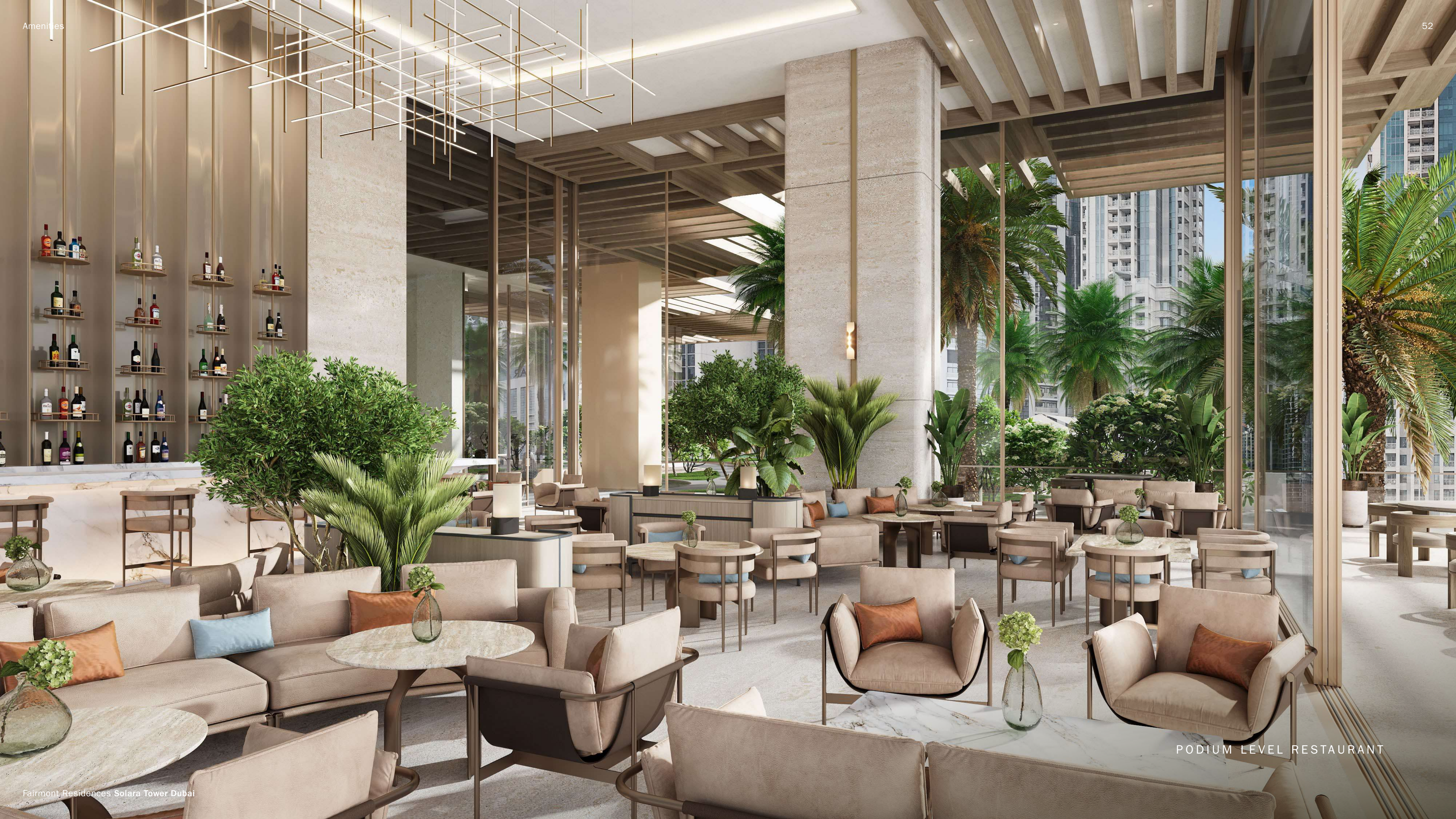
PODIUM LEVEL RESTAURANT