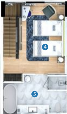
2nd floor plan