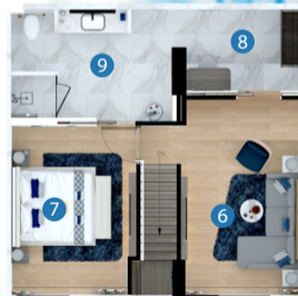
2nd floor plan