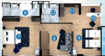
2nd floor plan