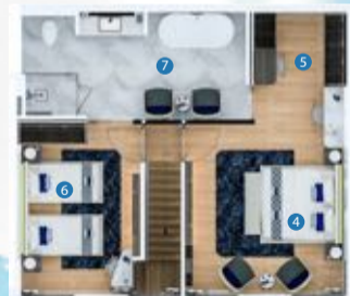
2nd floor plan