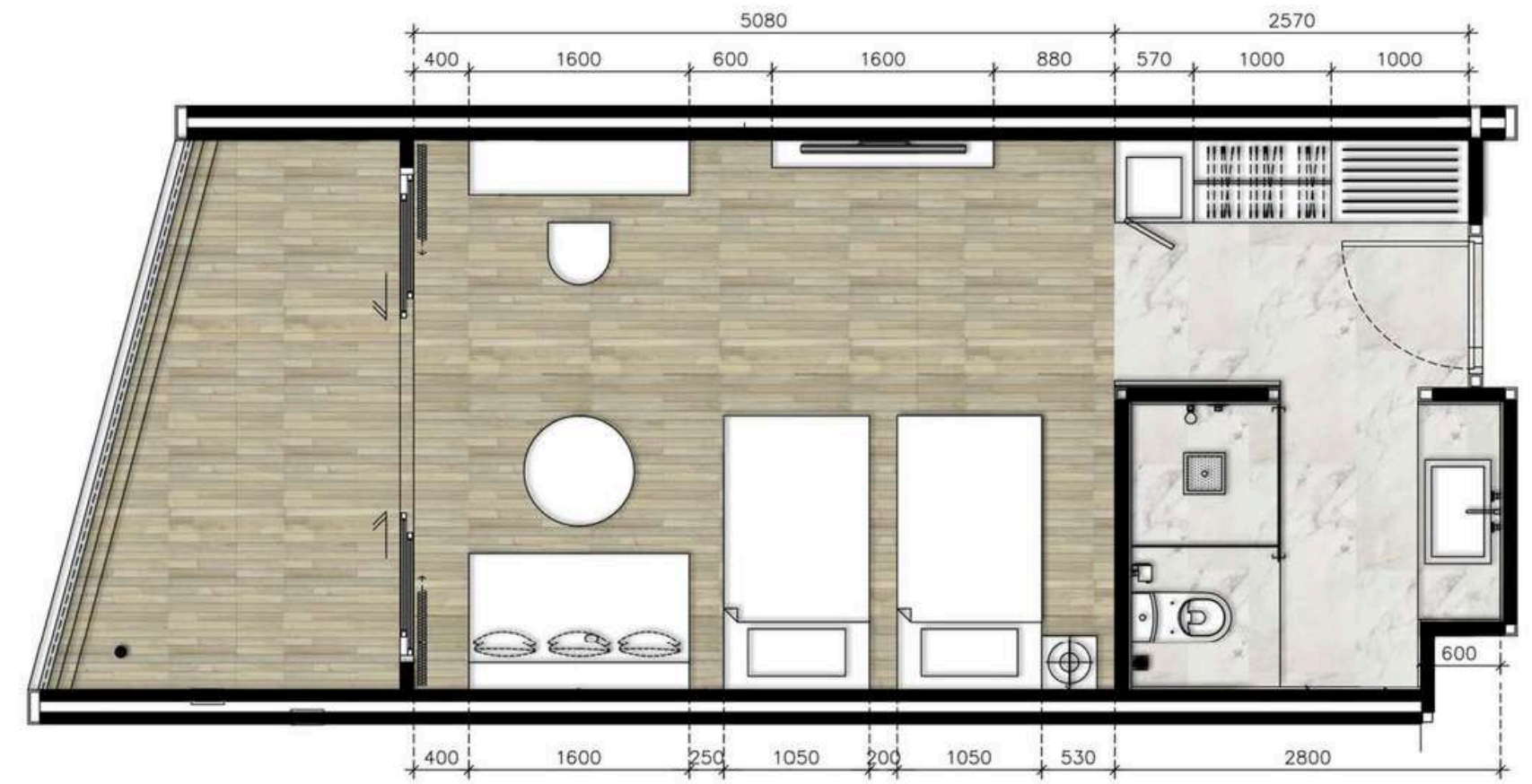
UNIT TYPE A 40.60 / 42.50 / 45.25 SQ.M.