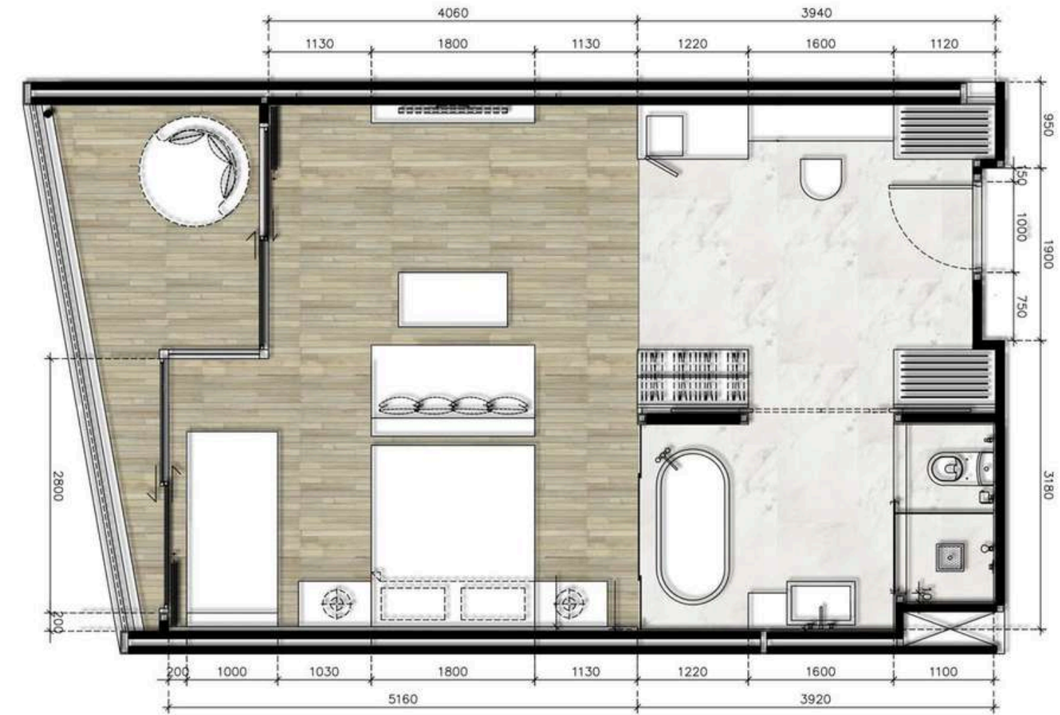
UNIT TYPE B 61.75 / 64.05 SQ.M.