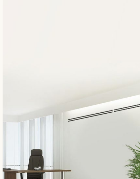
Variable Refrigerant Flow Air Conditioning System