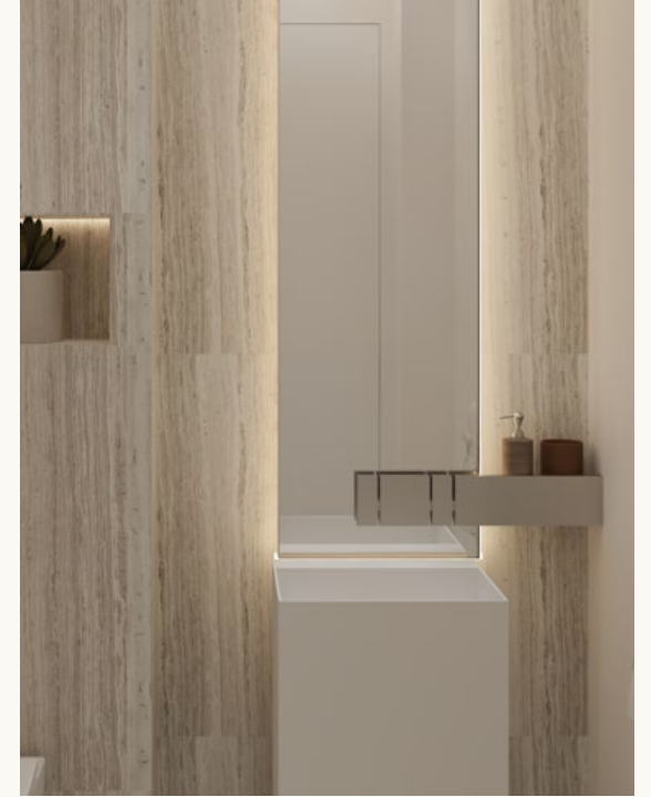
Detailed finishes with high quality materials