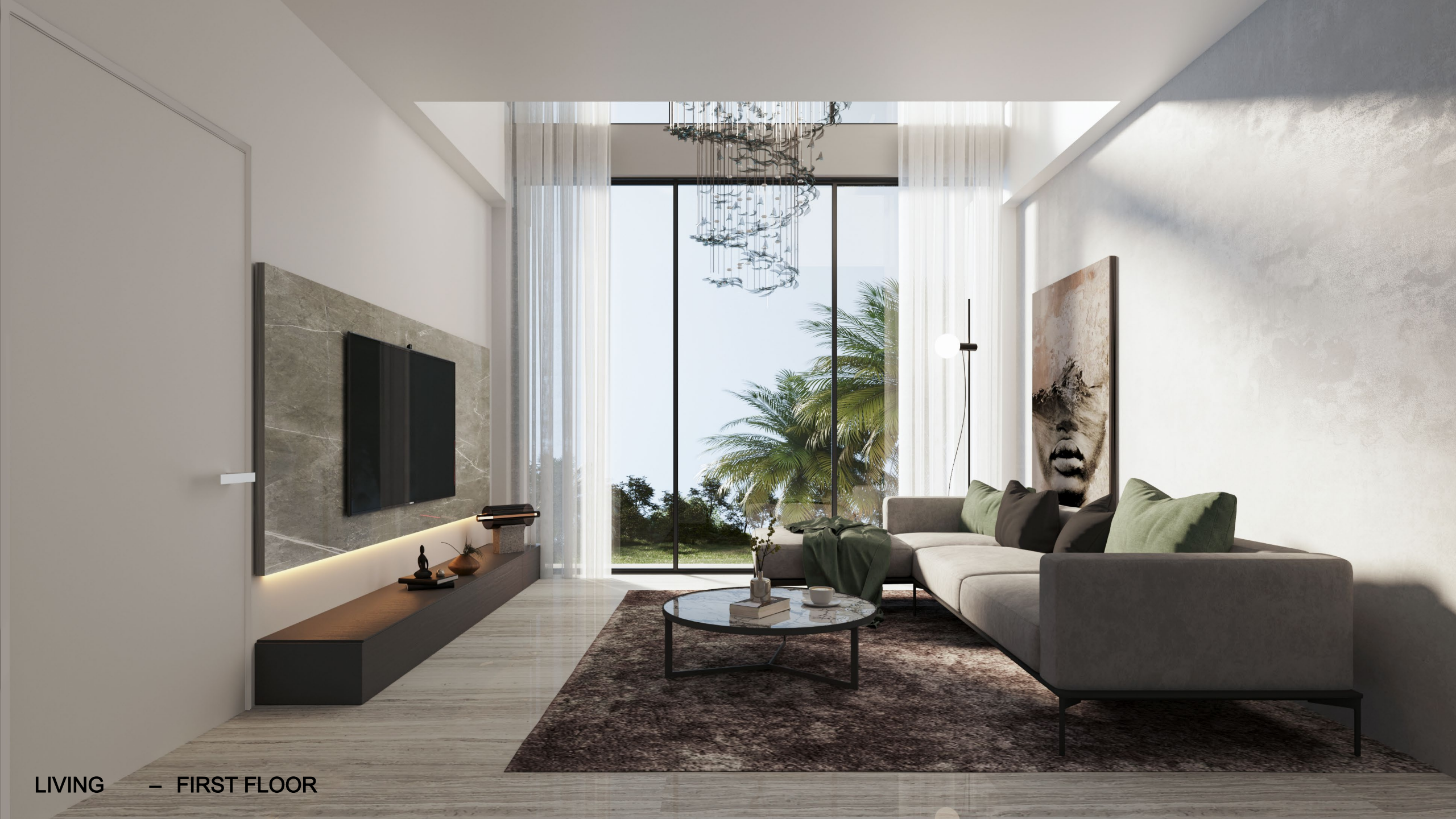
LIVING – FIRST FLOOR