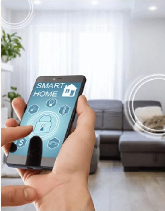
Sustainable and innovative home automation