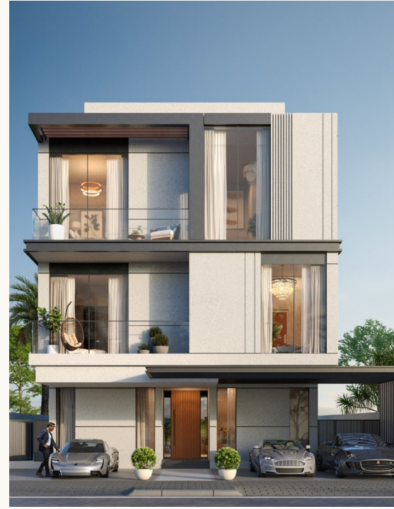
Wide parking spaces