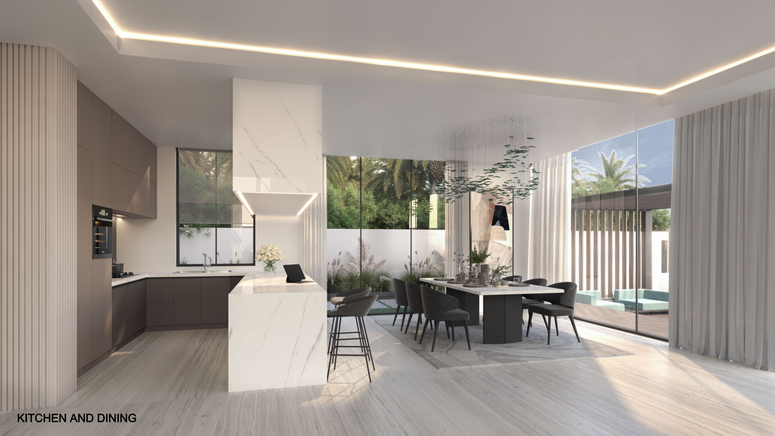
KITCHEN AND DINING