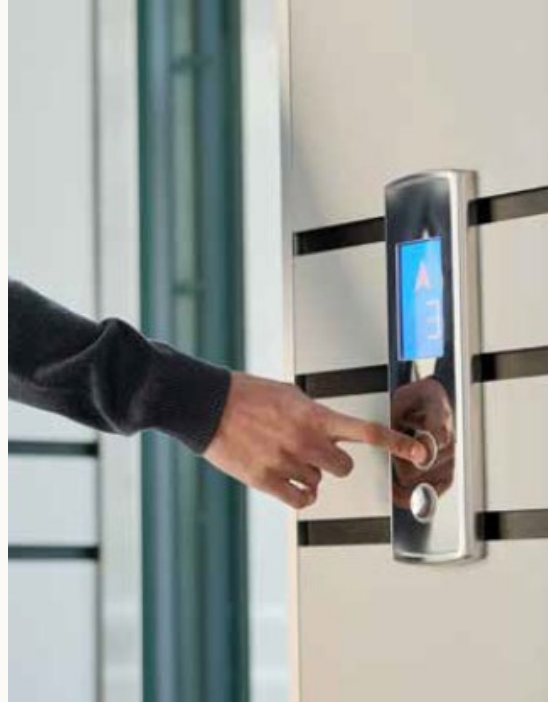
Modern home elevator