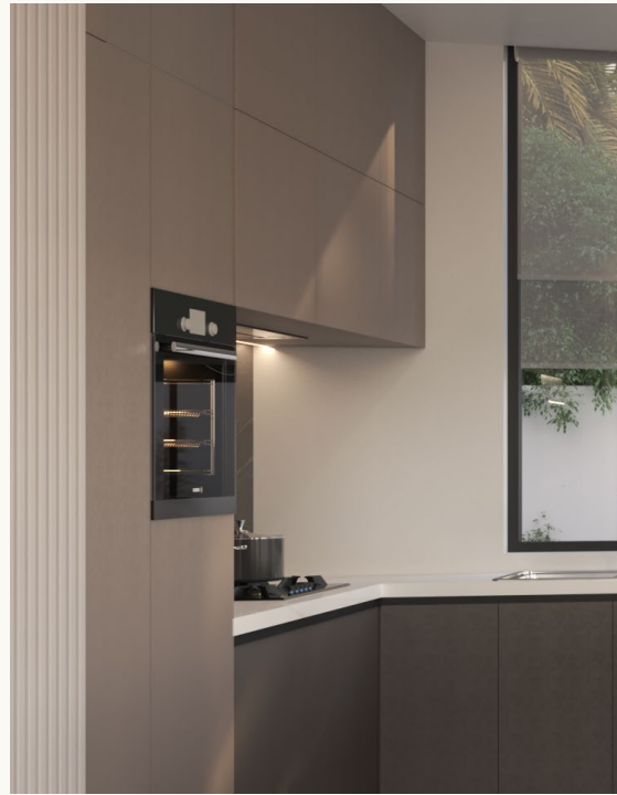
Modular kitchen with integrated appliances