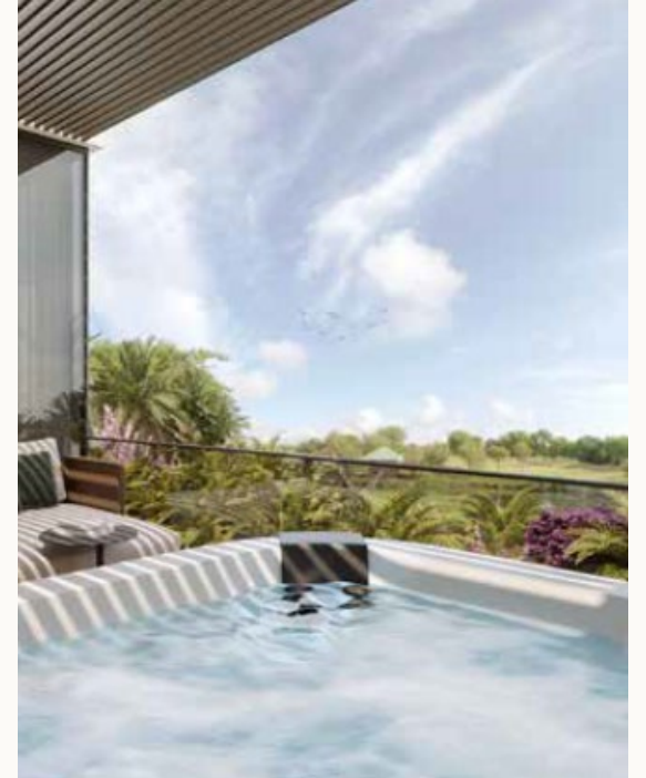
Private pool & jacuzzi