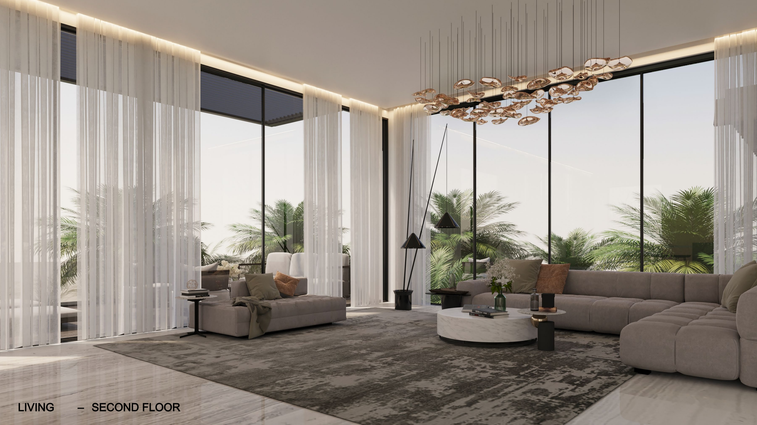
LIVING – SECOND FLOOR