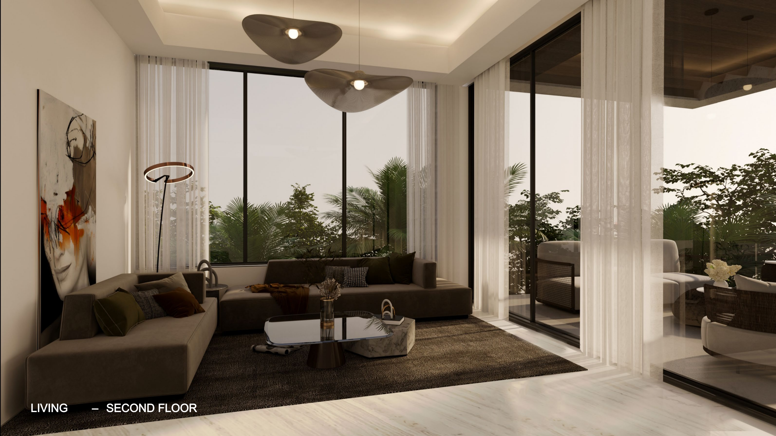
LIVING – SECOND FLOOR