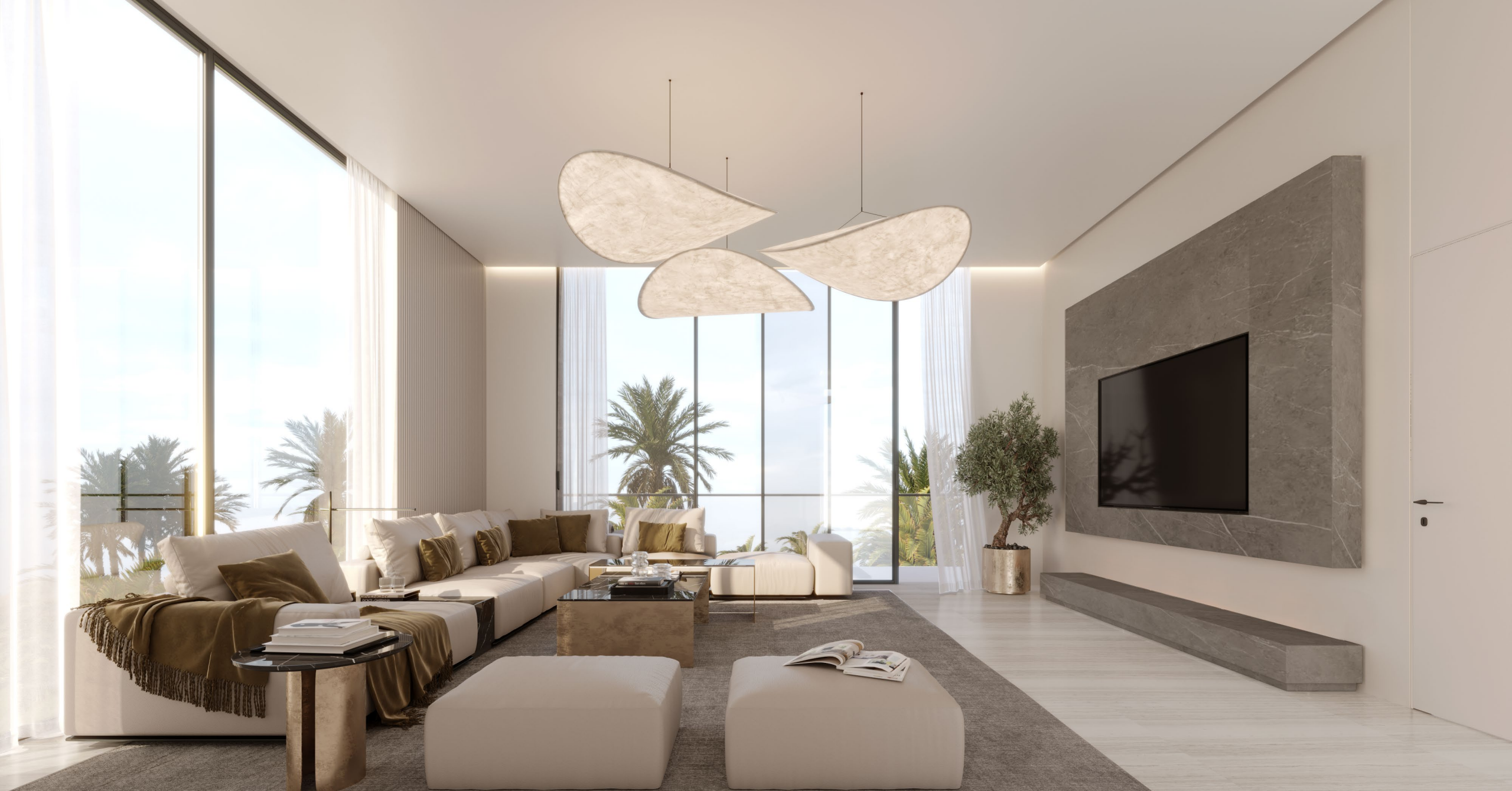
FAMILY LOUNGE FIRST FLOOR