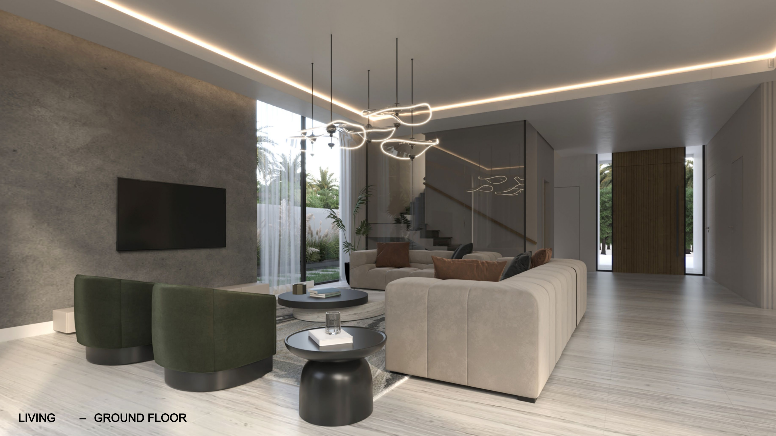
LIVING – GROUND FLOOR