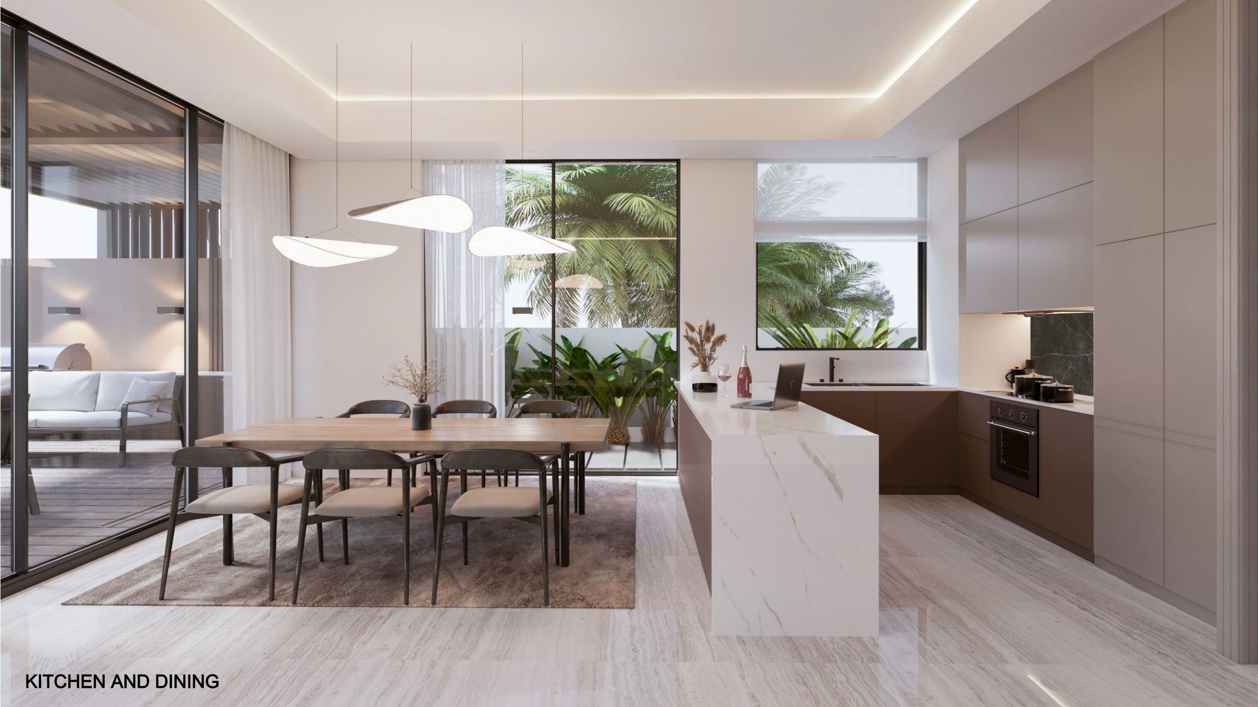
KITCHEN AND DINING