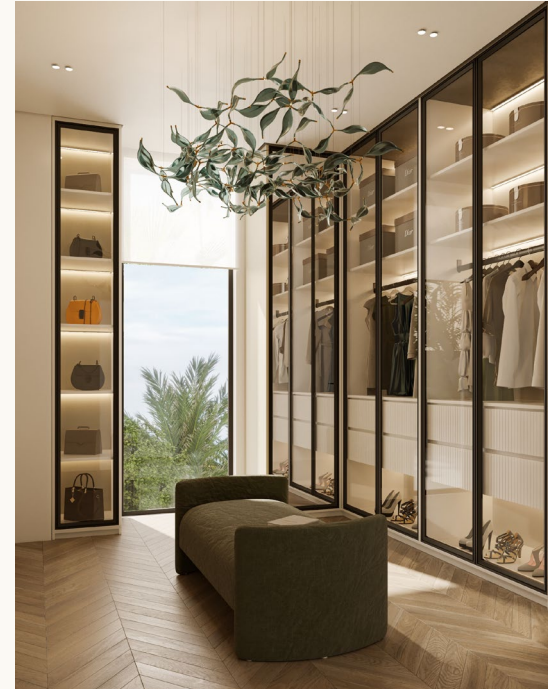
Thoughtfully spaced walk -in wardrobes