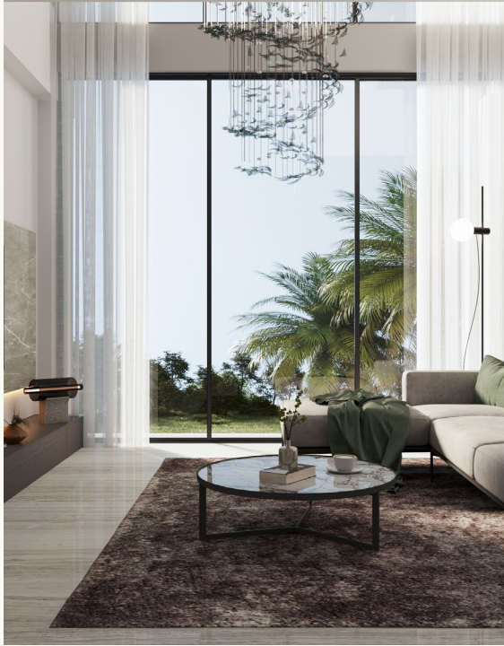
Floor to ceiling windows for internal -external connection