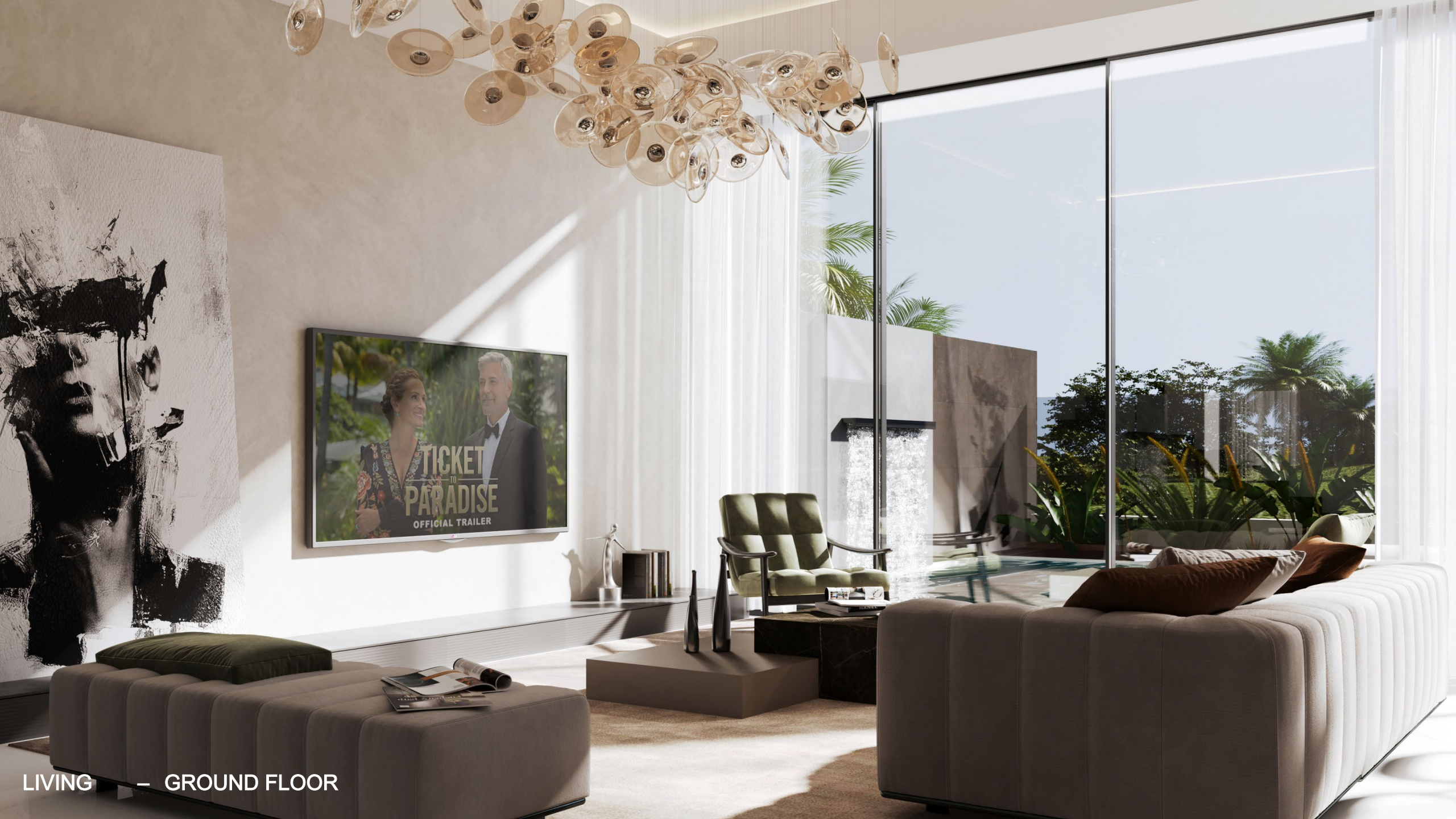
LIVING — GROUND FLOOR