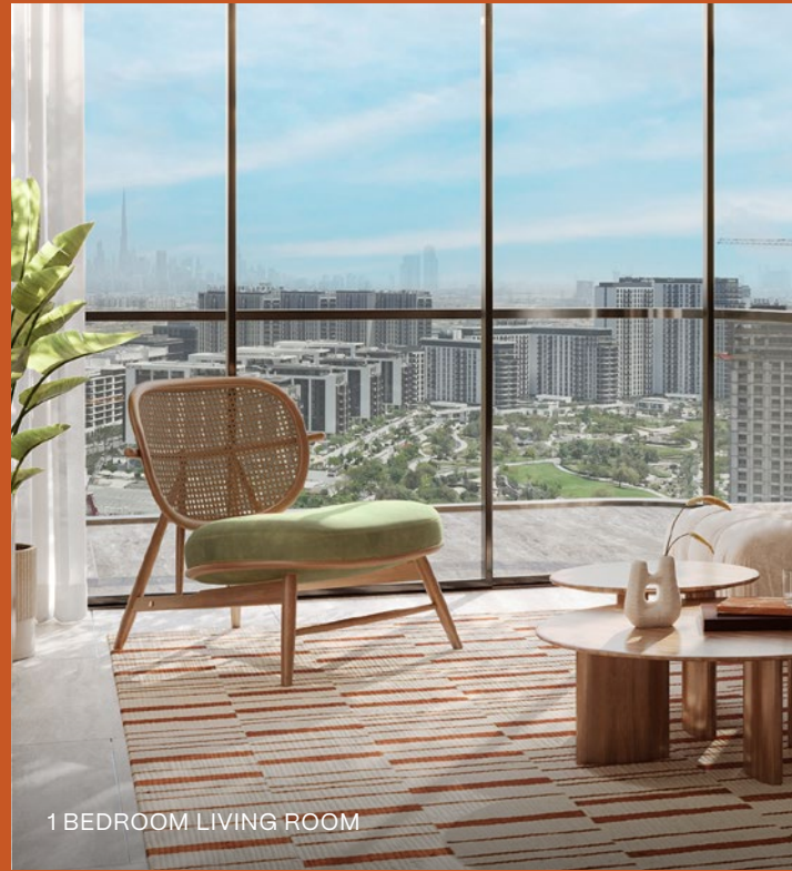
1 BEDROOM LIVING ROOM

Welcome to the only lifestyle branded residence in the community, Hyde Residences Dubai Hills. Where creative energy and contemporary luxe combine to create a lifestyle oasis in the heart of the city.