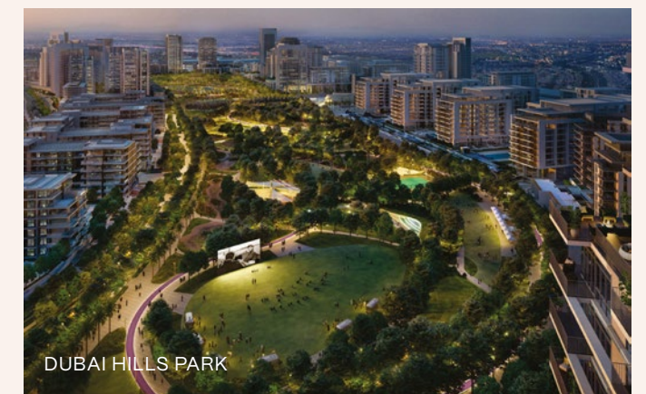
DUBAI HILLS PARK