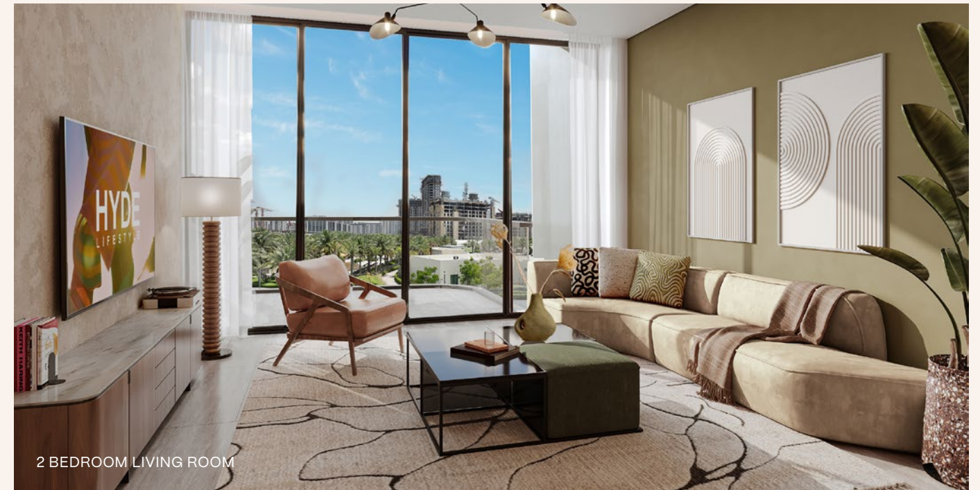
2 BEDROOM LIVING ROOM