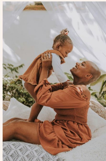
HYDE RESIDENCES DUBAI HILLS