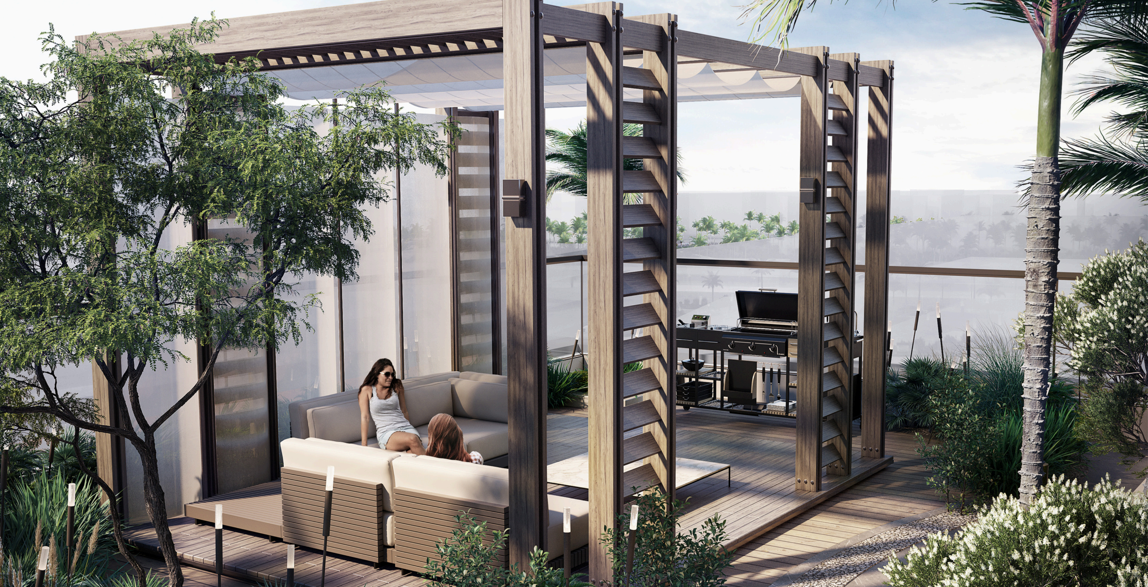
BARBEQUE & GRILL AREA