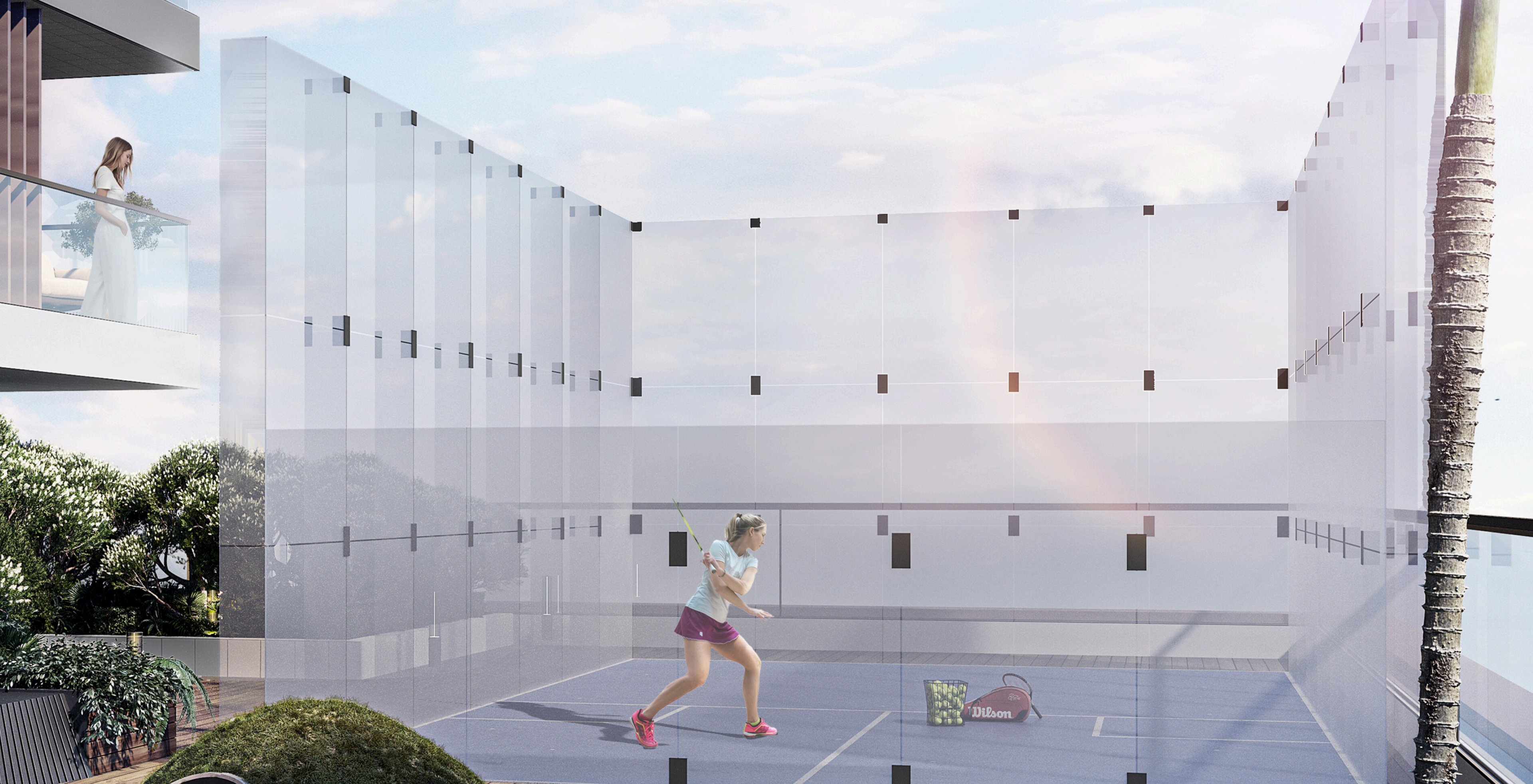
JOGGING TRACK SQUASH COURT