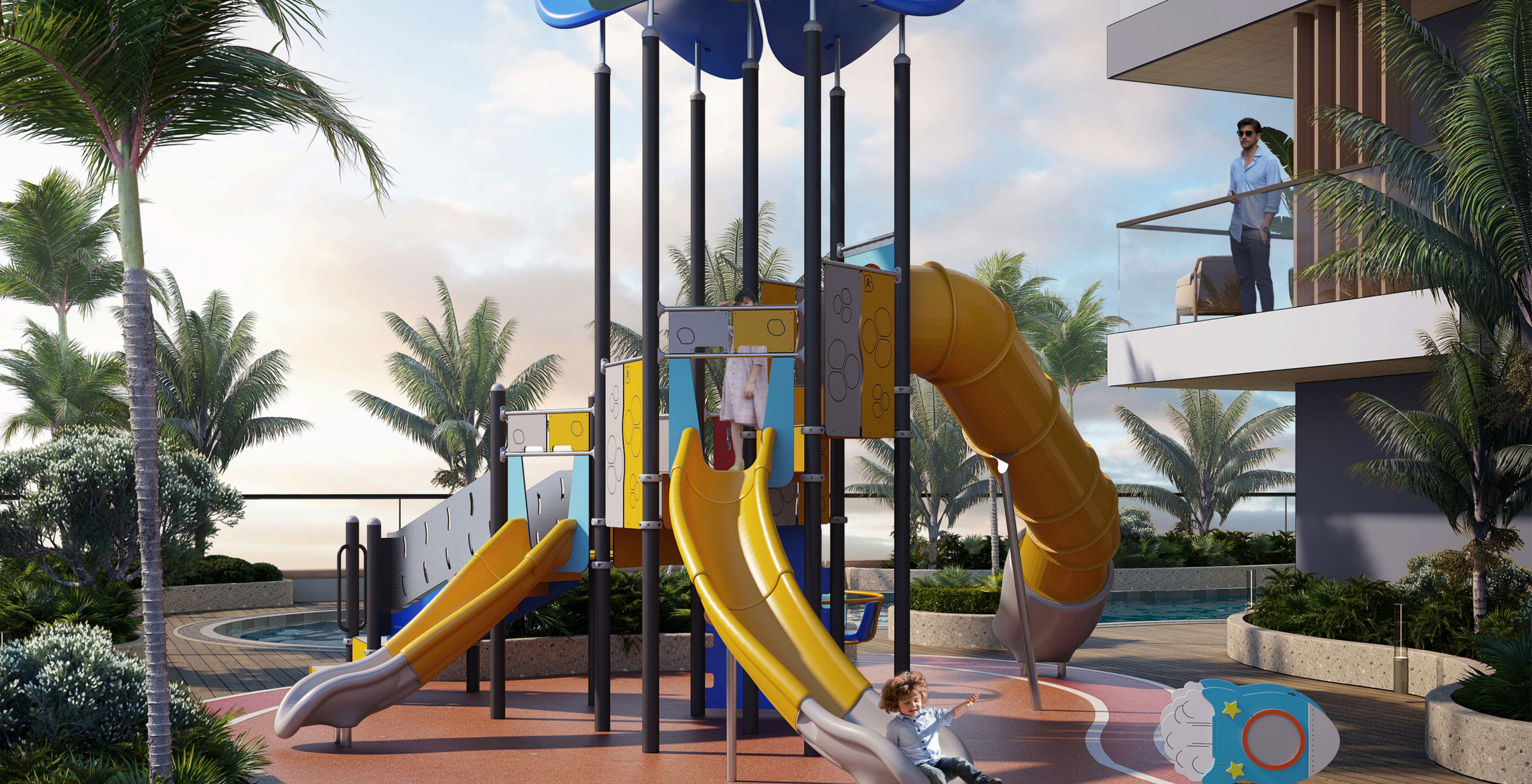
OUTDOOR & INDOOR KIDS PLAY AREA