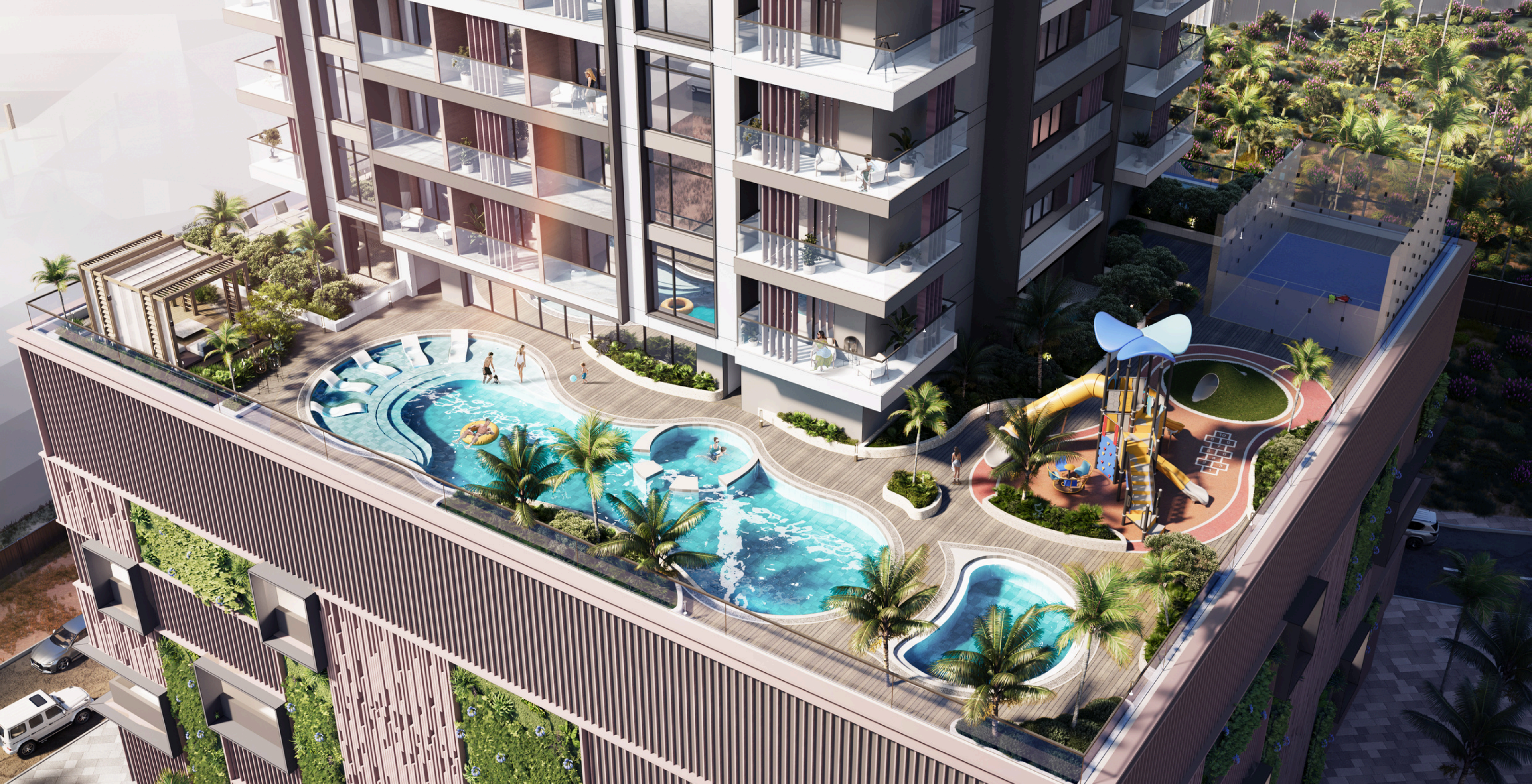
SALT WATER POOL