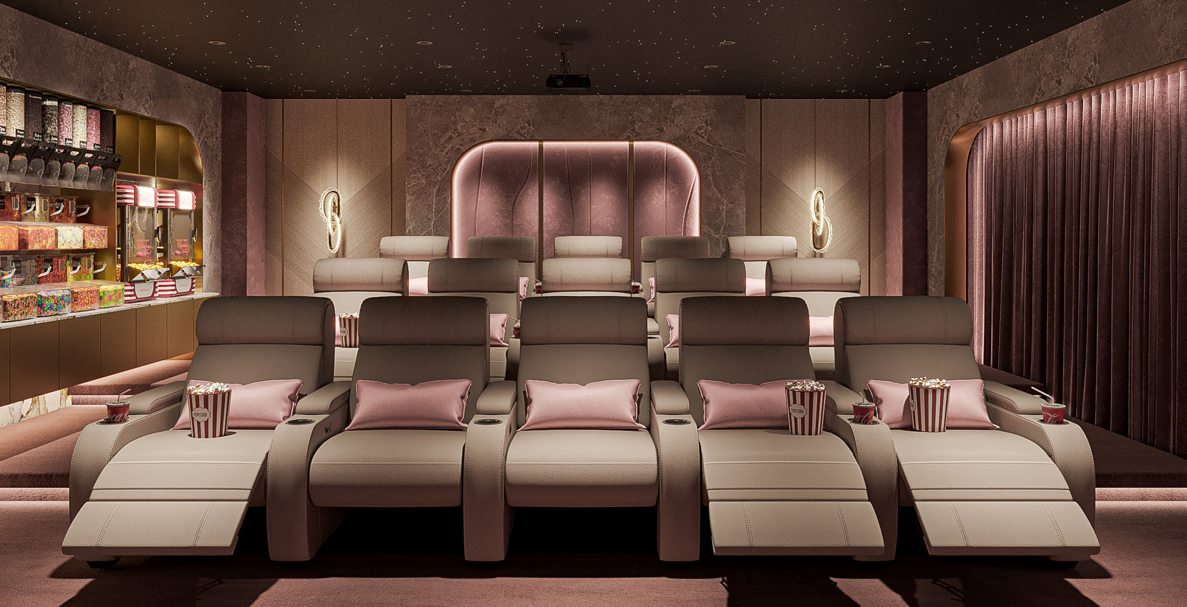
CINEMA ROOM FOR RESIDENTS