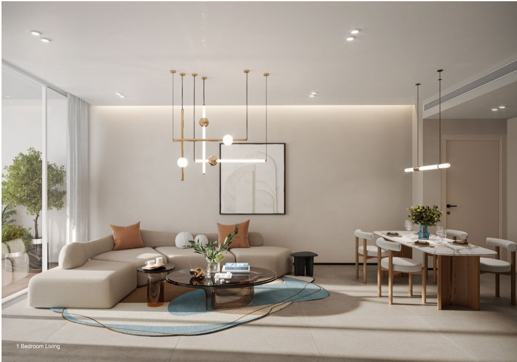
1 Bedroom Living