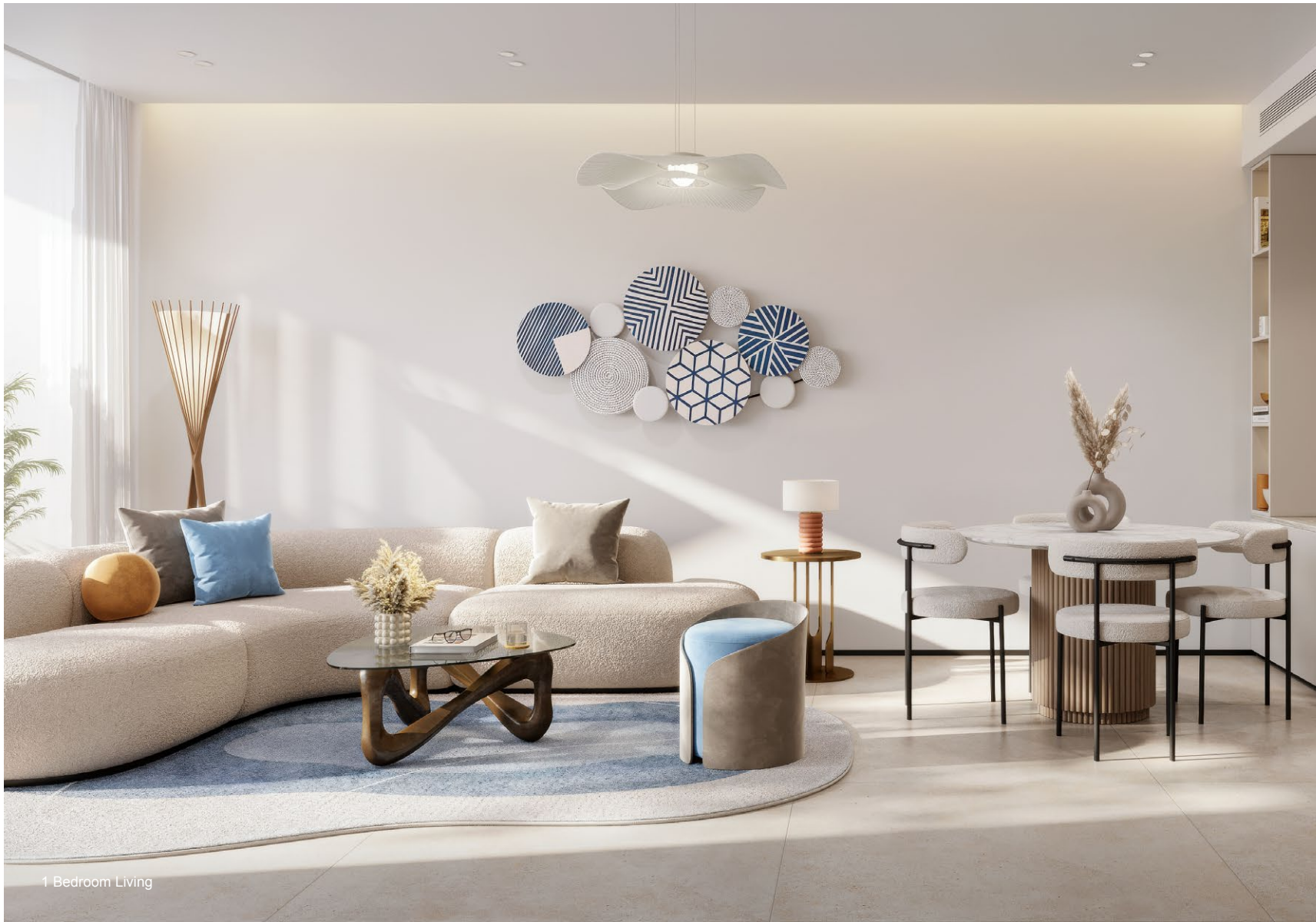
1 Bedroom Living