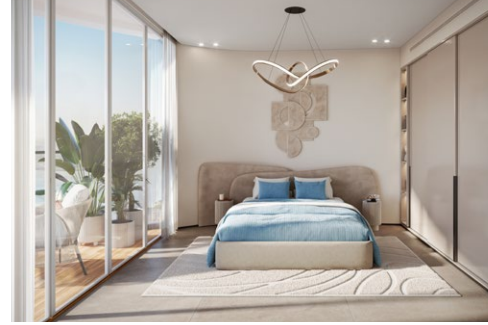
Large windows offer stunning views of the city, while the modern finishes and neutral color palette create a serene atmosphere.