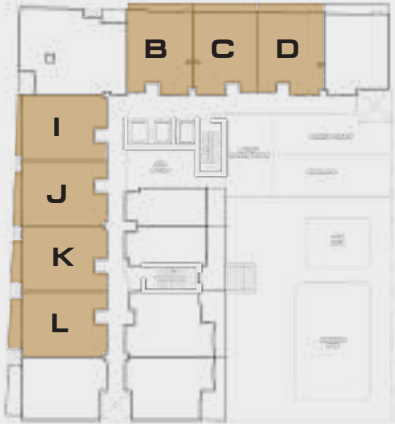
FLOORS: 1st Floor - 8th Floor