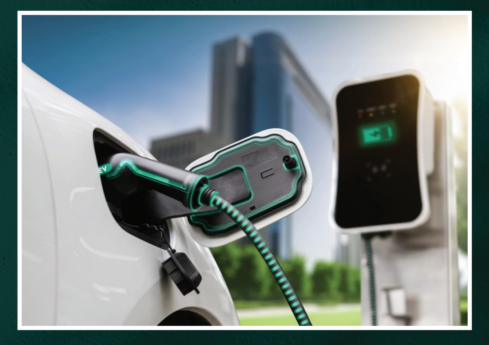
EV Charging Station

Our Advanced Number Plate Recognition system provides seamless and secure access to parking space.