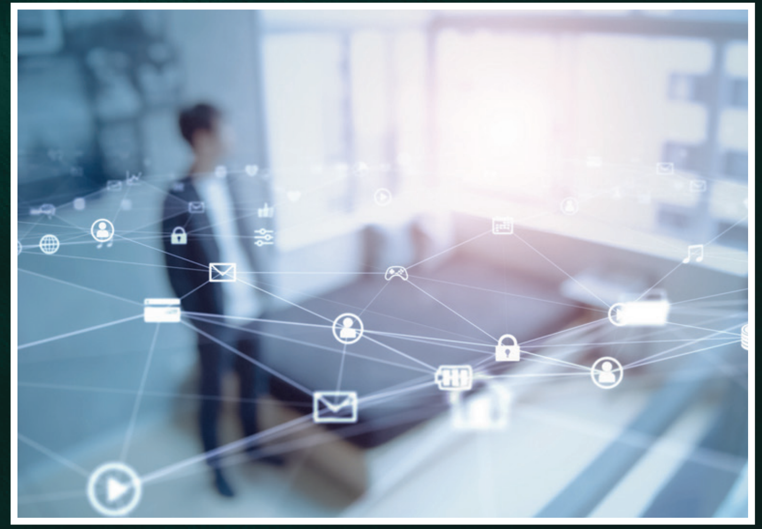
Smart Home System with ALEXA Voice Assistant