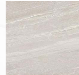
Faience Museum Mainstone Cloud Mat