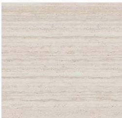
Travertino Pearl Porcelain