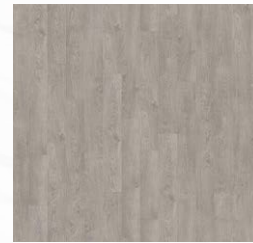
Parquet Grey Ashwood