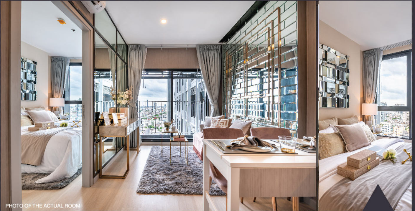
PHOTO OF THE ACTUAL ROOM