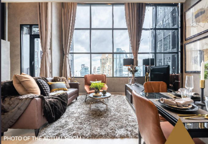
PHOTO OF THE ACTUAL ROOM