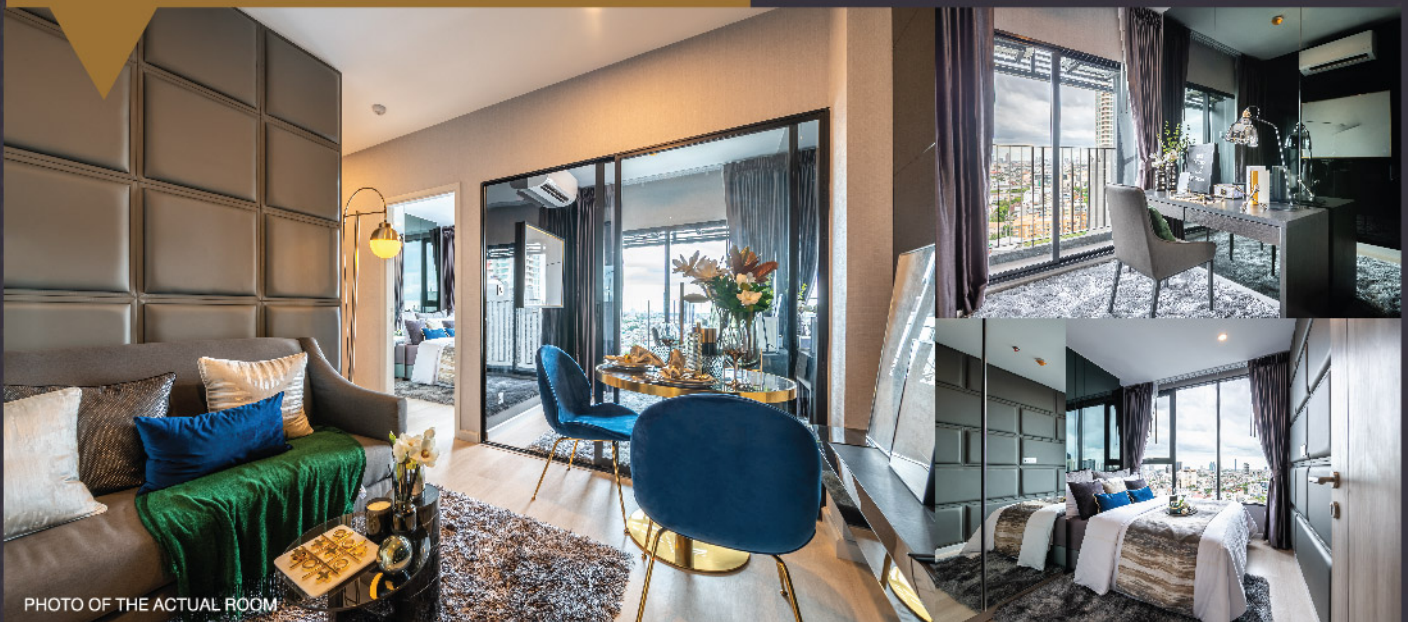
PHOTO OF THE ACTUAL ROOM