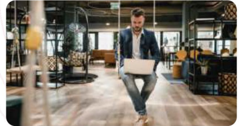
Various lounges for movies, co-working, art, and music