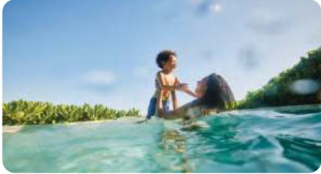
Swimming pools in each cluster including kids' pool, lap pool, pool deck with cabanas, pool bar, spa pool, cascading waterfall