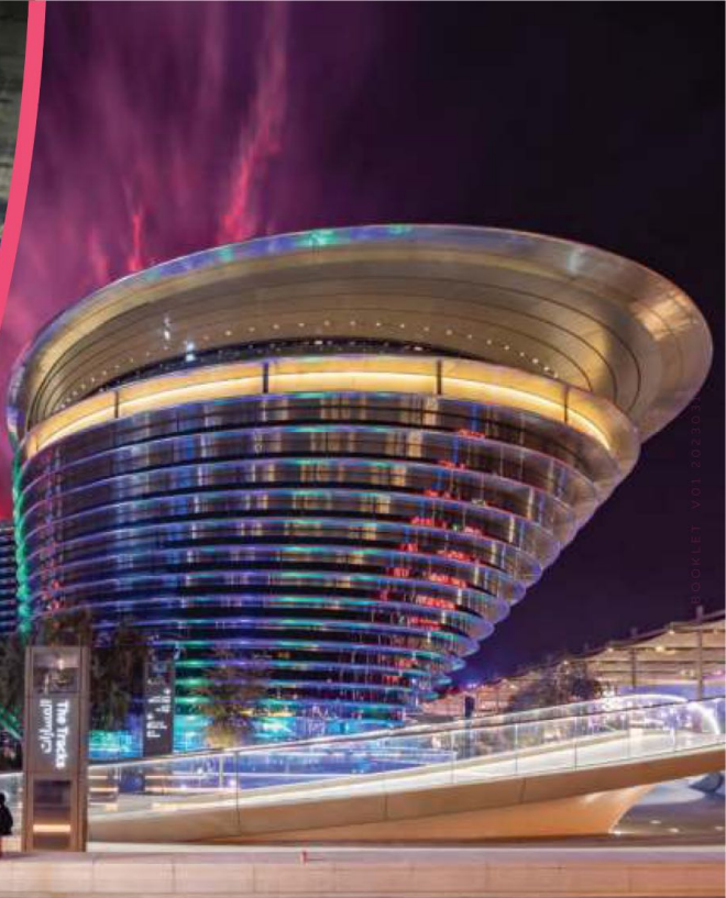
Alif – The Mobility Pavilion Exploring how we move, explore and connect