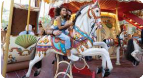
Kids' play area