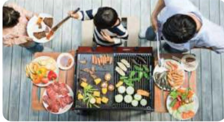
BBQ areas, outdoor dining pavilion