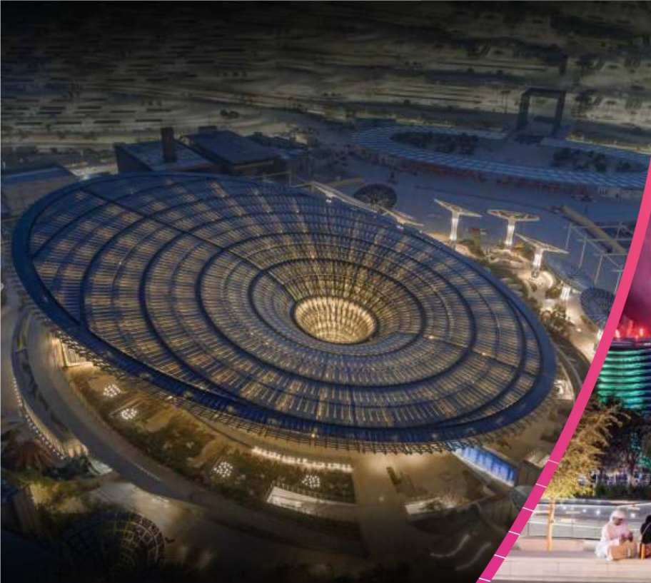
Terra – The Sustainability Pavilion Providing real life solutions to preserve our planet